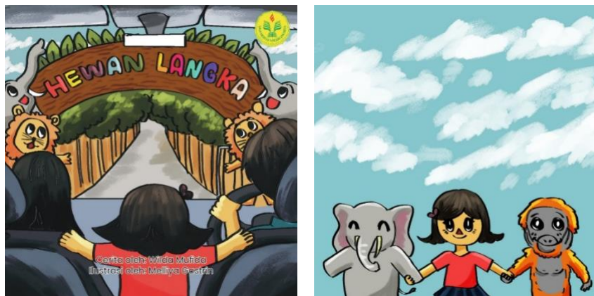
Figure 3. Front and Back Cover

In the analysis stage, there are two stages. The first stage is the analysis stage. Problem identification in the form of observations during PKM and needs analysis through interviews with teachers and fourth-grade students. The results of problem identification and needs analysis then selected one material that became the target developer. The subject matter is about preserving rare animals. The second stage of design is the stage of designing wordless picture book teaching materials, including preparation of feasibility test instruments, preparation of materials, preparation of tools and materials to create concepts, then compiling story narratives and making storyboards. The third stage is development. At this stage, the storyboard idea is developed through the services of an illustrator entitled rare animals. The following is the cover of the product produced.