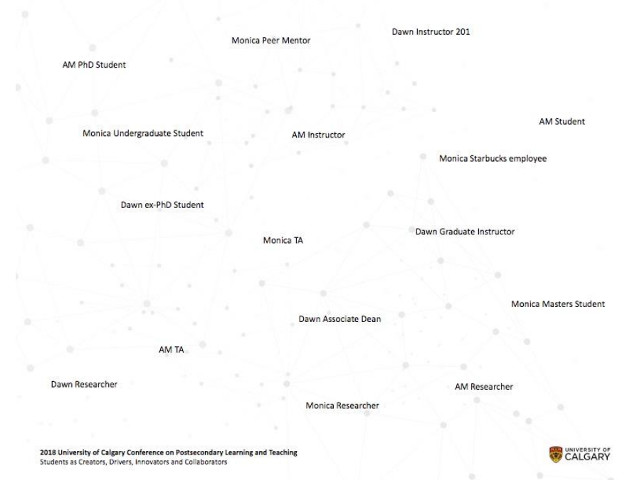
Figure 1. Movements in mentorship identity mapping stage one.