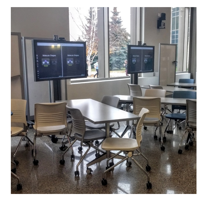
Figure 1: Room setup for tutorial sessions, arranged to accommodate two groups of 4 students per touchscreen.

During the tutorial, students worked in self-selected groups of four, with every two groups sharing a single touchscreen that displayed two side-by-side web browser windows open to the Molecule Shapes sim (Figure 1).