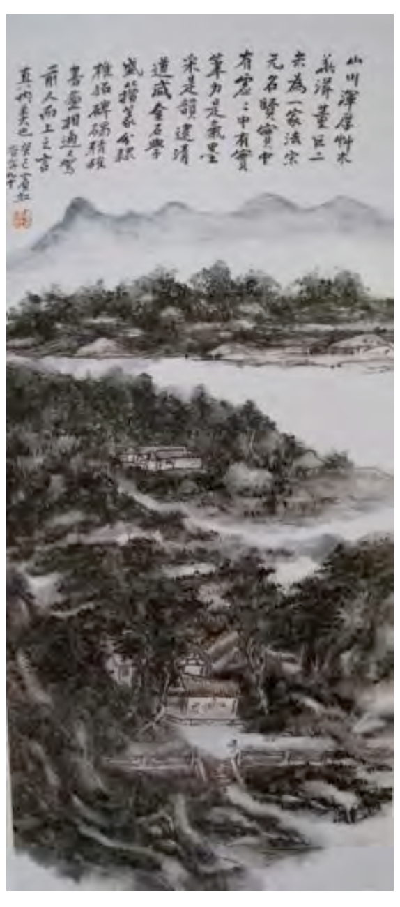
Figure 15: Huang Binhong, hanging scroll, Landscape, ink on paper, 1953 [Reproduced in Huang Binhong jingpin ji (2004: 64). Collection of the National Art Museum of China]

In a striking painting which exhibits an even freer and more abbreviated brush technique Huang refers to the brushwork of Hu'er [his ancestor Huang Sheng b. 1622], which he describes as being as 'powerful as a bronze [ceremonial vessel or] ding .' The inscription continues: 'I believe that Bao [Shichen], Zhao [Zhiqian] and other virtuous men of the Daoguang and Xianfeng periods did in fact surpass men of earlier times.' Bao Shichen (包世臣 1775–1855) and Zhao Zhiqian (趙之謙 1829–1884), both active in the late 1800s, were important scholar-artists who developed individual calligraphic