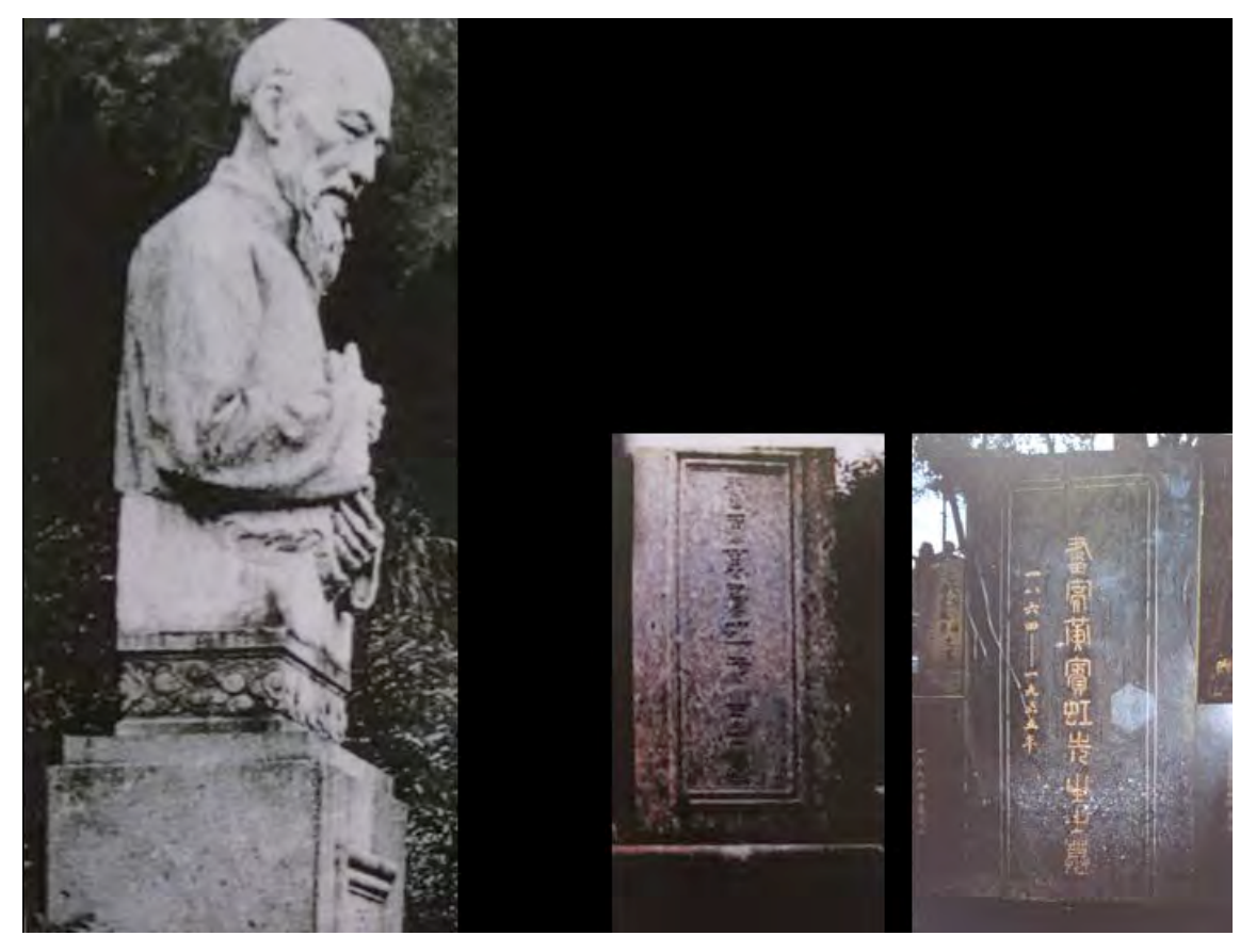
Figure 16: Huang Binhong's grave: grave sculpture and new headstone. [Grave sculpture reproduced in Wang Zhongxiu (ed.), Huang Binhong nianpu (2005: 560–61)]

Huang Binhong is buried in the Nanshan Cemetery in Hangzhou. The original tombstone that marked his grave incorporated a carved torso of the artist wearing a traditional gown, his head bowed and hands clasped to his chest, holding a book. The grave was desecrated during the Cultural Revolution and the sculpture smashed. Today a sombre black granite headstone has replaced the original. It is engraved with the words 'Artist Huang Binhong's Grave 1864–1955' ( Huajia Huang Binhong xiansheng zhi mu 畫家黃賓虹先生之墓). The Seal script inscription was copied from the original grave marker, written by Pan Tianshou (潘天寿 1897–1971) a fellow artist and academy professor who died in 1971 as a result of his suffering during the Cultural Revolution.