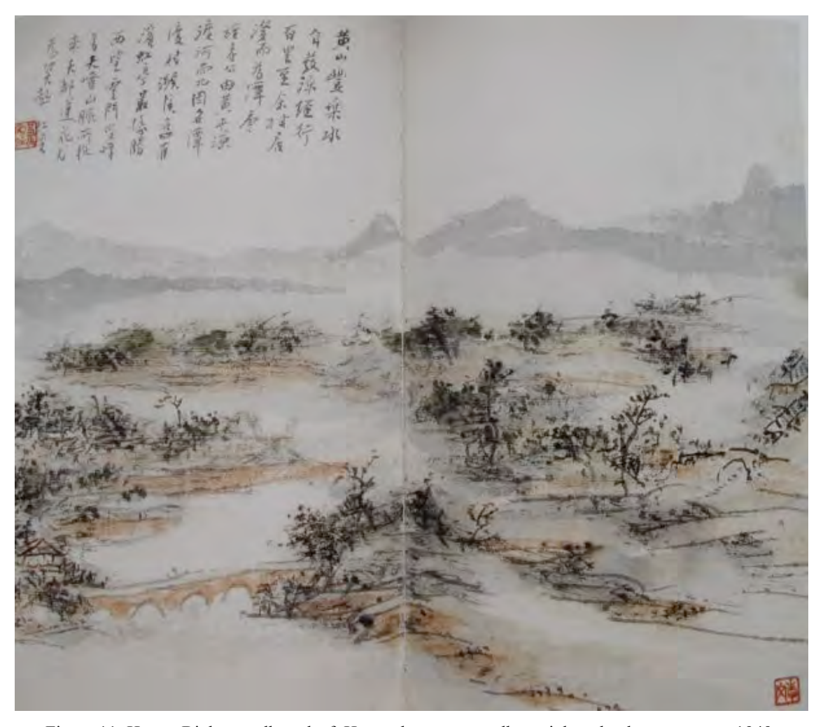
Figure 11: Huang Binhong, album leaf, Huangshan wo you album, ink and colour on paper, 1949. [Reproduced in Huangshan woyou: Huang Binhong quanji (2006, vol. 5: 176–77)]

Huang did not travel to Huangshan again, through painting he was able to return there in spirit. The title page is inscribed in seal script 'Travelling in Huangshan while remaining at rest' ( Huangshan woyou 黄山臥游) and is followed by an introductory text written in a blunt cursive calligraphy: 'Every pine tree and rock in Cloud Valley has found its way into these paintings. The sound of a lute being strummed and the movement of someone exercising echo the sound of the mountains.' The album is intended to be read like a book. Paintings and poems written by Huang Binhong during his travels to Huangshan face one another on the page highlighting the interdependence of calligraphy, poetry and painting. In the middle of the album is a painting that continues across the two leaves, a misty, low-lying landscape executed with a dry brush and subtle colour washes. In the lower left corner there is a pavilion on the bank of a river, close to a large bridge that spans the waterway. Another bridge can be discerned to the right of the composition suggesting a complex river system. It is inscribed: