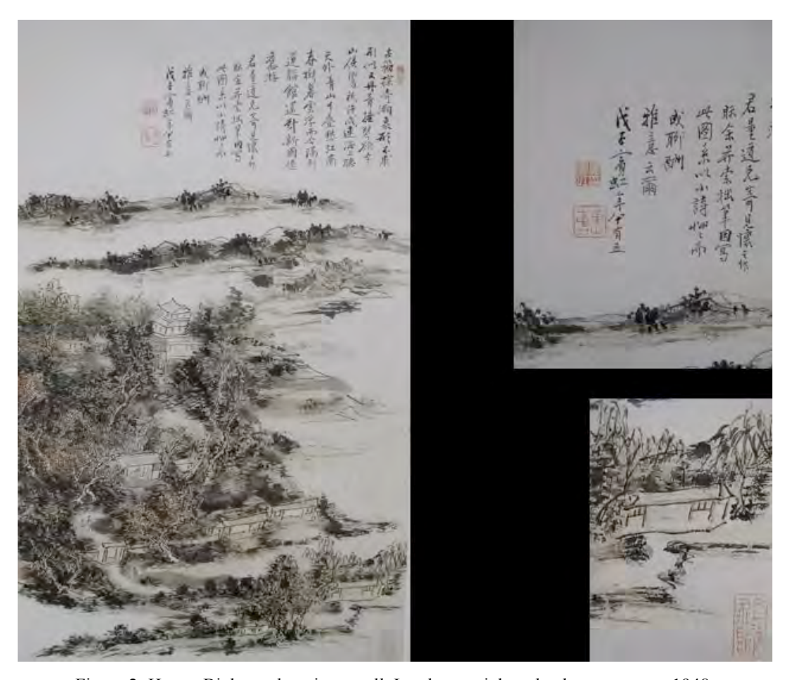
Figure 2: Huang Binhong, hanging scroll, Landscape, ink and colour on paper, 1948. [Reproduced in Huang Binhong quanji (2006: vol. 10, 257)]

Huang's multiple identities, as artist, scholar, collector and connoisseur were integral to his creative practice (Roberts 2010: 52–53). Like many of his contemporaries born in the late nineteenth century (at the end of the Qing dynasty) he received a classical