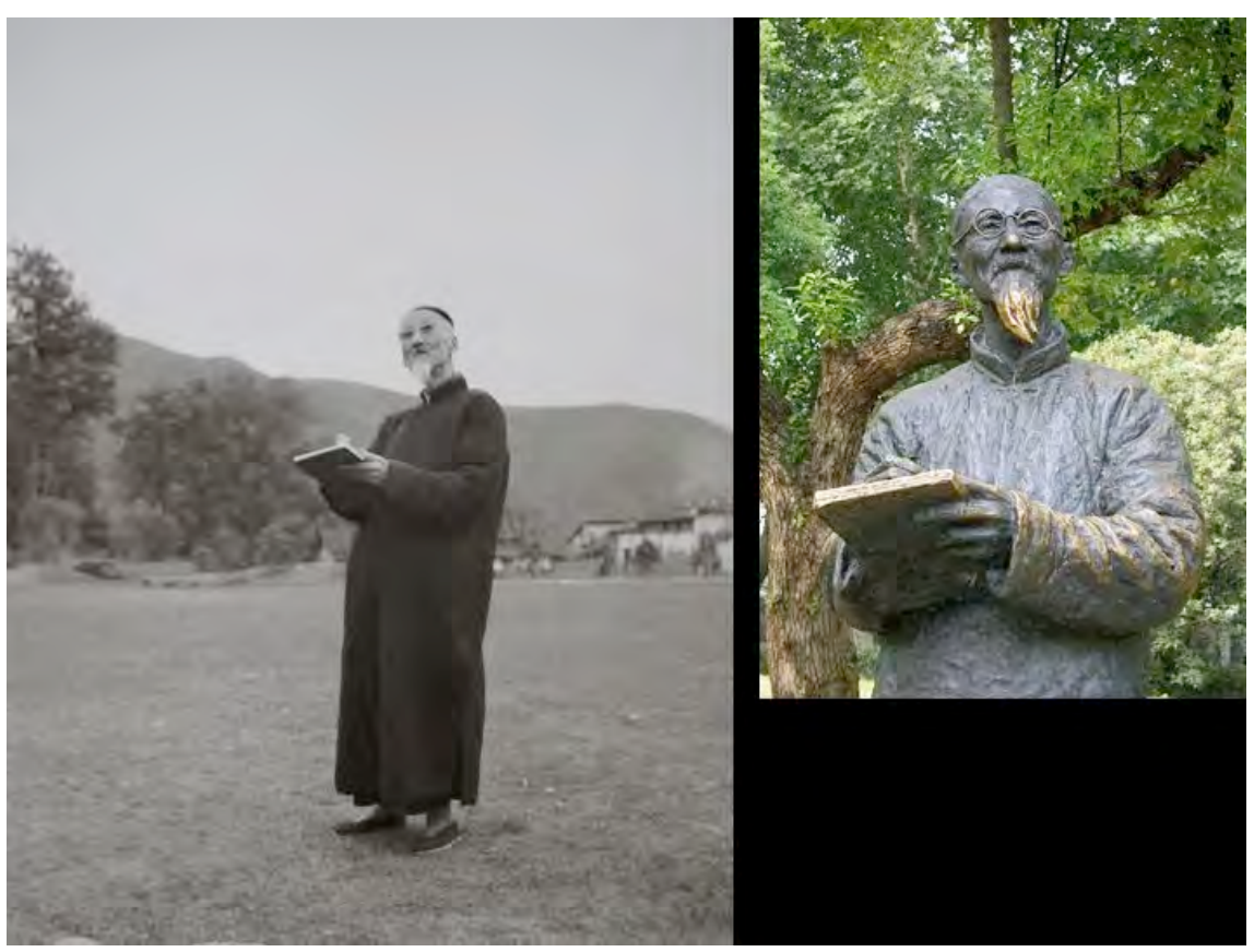
Figure 17: Photograph of Huang Binhong sketching and contemporary bronze sculpture. [Photograph of Huang Binhong sketching reproduced in Huang Binhong quanji (2006: vol. 10, 289; photograph of bronze sculpture © Claire Roberts]

Lake en-plein-air . The use of an image that depicts the artist sketching from life, or to use the parlance of the day 'seeking truth from facts', reflects a desire, perhaps, to better align Huang Binhong with the title bestowed on him in 1953, 'Outstanding Artist of the Chinese People,' in the hope of redefining him as a people's artist, rather than the scholar-artist that he was.