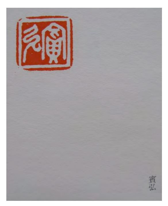
Figure 7: Li Yinsang seal – 'Binhong.' [Collection: Zhejiang Provincial Museum, Hangzhou]