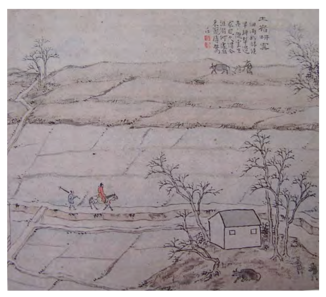
Figure 5: Huang Lü, album leaf, Eight Views of Tandu, ink and colour on paper, early 1700s. [Collection: Zhejiang Provincial Museum, Hangzhou]

The 'Eight Views' depict life in the ancestral village and its situation on wide river flats at the confluence of numerous waterways. Each leaf is accompanied by a twenty-eight character poem. The album opens with a painting entitled 'Waiting for the moon by the bank of the river.'