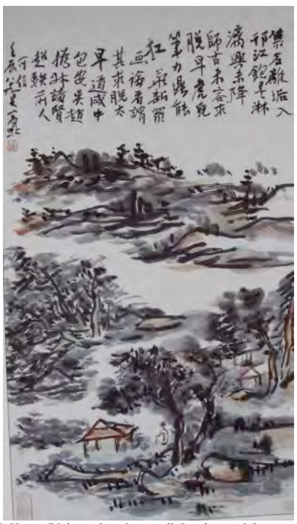
Figure 14: Huang Binhong, hanging scroll, Landscape, ink on paper, 1952. [Reproduced in Huang Binhong quanji (2006, vol. 3: 104)]

In the inscription on a bold calligraphic painting Huang Binhong refers to the work of the late Qing calligrapher He Shaoji (何紹基 1799-1873) who created an individual style based the systematic study of ancient stone inscriptions (Chang et al. 2000: 66– 69).<sup>26</sup>