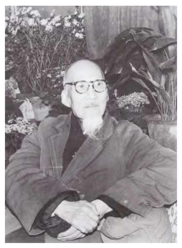
Figure 12: Photo of Huang Binhong taken in Beijing in 1951. [Reproduced in Huang Binhong quanji (2006: vol. 10, 268)]

recognition by Communist authorities at the national level. Huang was a specially invited public figure and participated in most of sessions of the week-long conference.<sup>22</sup>