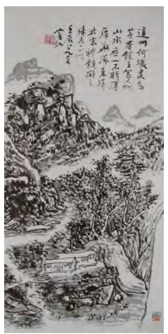
Figure 13: Huang Binhong, hanging scroll, Landscape, ink on paper, 1952 [Reproduced in Huang Binhong quanji (2006, vol. 2: 232)]

Inscriptions on paintings from this period often refer to the art and calligraphy of the Daoguang (1821–1850) and Xianfeng (1851–1861) periods of the late Qing dynasty—