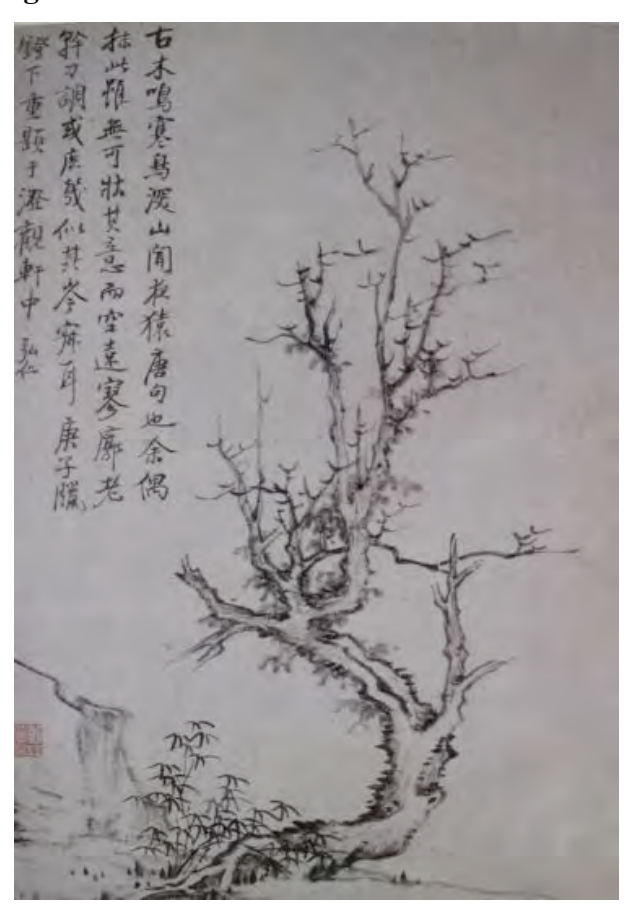
Figure 6: Hongren, hanging scroll, Ancient tree, ink on paper, 1669. [Collection: Zhejiang Provincial Museum, Hangzhou]

Huang Binhong's fascination with Shexian and Huangshan was complex and multifaceted, at once literary, visual and experiential. His identification with Huangshan is highlighted in signatures on paintings and references to his collection: 'Hongruo from below Tiandu Peak of Huangshan' ( Huangshan Tiandu xia Hongruo 黄山天都下虹若) and 'from the collection of Huang Binhong's studio at Tiandu' ( Tiandu Huang Binhong 天都黃賓虹). <sup>12</sup> Tiandu refers to the Heavenly Citadel Peak ( Tiandufeng 天都峰) of Huangshan and alludes to the Tiandu School which was synonymous with the Huangshan or Xin'an school of artists.