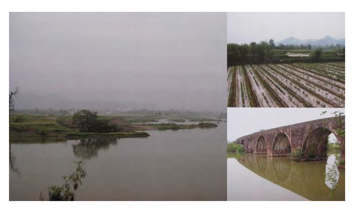
Figure 3: Photos of Tandu village and site of the Binhong Pavilion.

The presence of abundant supplies of timber attracted skilled carvers and contributed to the growth of high-quality wood carving workshops in Shexian. Local timber was used to make wood blocks for printing books and carved wooden moulds for ink sticks that were both practical and prized by collectors. Creative collaborations between scholars, artists, artisans and entrepreneurs produced high quality illustrated books.<sup>6</sup>