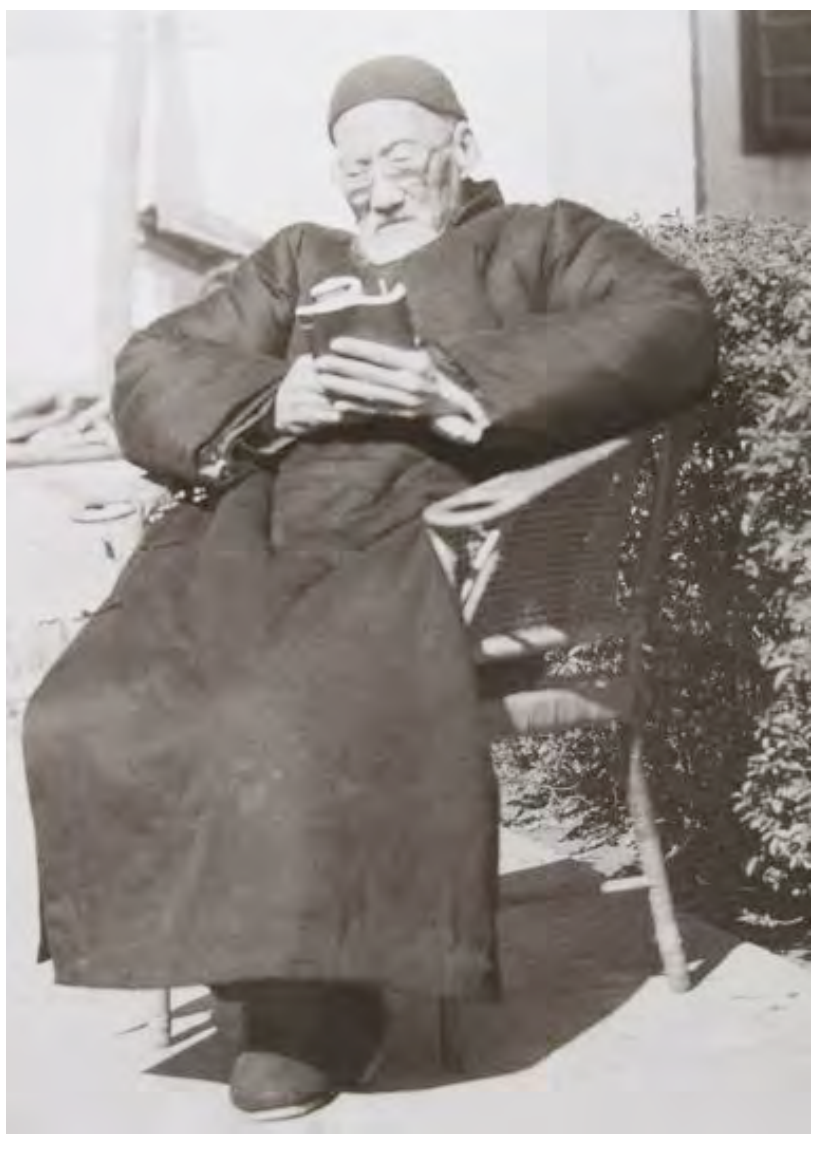
Figure 1: Photo of Huang Binhong reading at home in Hangzhou. [Reproduced in Huang Binhong quanji (2006: vol. 10, 289)]

PORTAL Journal of Multidisciplinary International Studies, vol. 9, no. 3, November 2012. Politics and Aesthetics in China Special Issue, guest edited by Maurizio Marinelli. ISSN: 1449-2490; http://epress.lib.uts.edu.au/ojs/index.php/portal PORTAL is published under the auspices of UTSePress, Sydney, Australia.