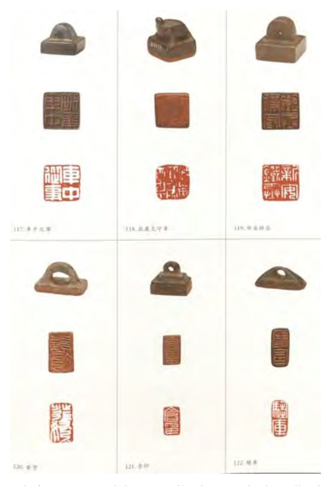
Figure 9: Ancient seals from Huang Binhong's collection now in the collection of the Zheijiang Provincial Museum, Hangzhou. [Reproduced in Zhongguo lidai xiyin yishu (2000: 71)]

Seals made from stone or bronze were official accoutrements used to identify a person or an institution. They could be inscribed with a person's title, office or name, pen name or studio name (or poem or symbolic image) and were understood to embody the authority of the person or institution.