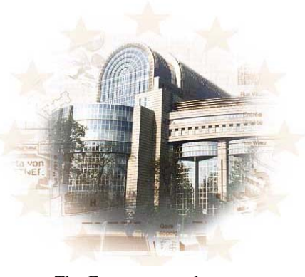
The European parliament

The first point: In western democracies parties always do have programs in which they mostly describe their view of the future. In this programs they are saying which kind of world they would like to have. In other words their ideology is written down in such programs. Parties try to work on guiding strategies and inform the people about try to develop strategies for the future and alternative action possibilities. To write down such a program takes a lot of time, because different party wings want to contribute their views. Especially for the huge parties this process is difficult, because their wings have grown up historically. Considering the social democrats for example, they traditionally have two completely different wings. The most crucial point discussing the program and the strategy for the next campaign is the labour market policy. Because the people want to grant from the polity and the new government. People mostly think rational, so they do not to pay attention that much to programs, they want to know which advantages they can expect from that party if it wins the election. And traditionally the different social democratic wings have different views about the right labour market policy.