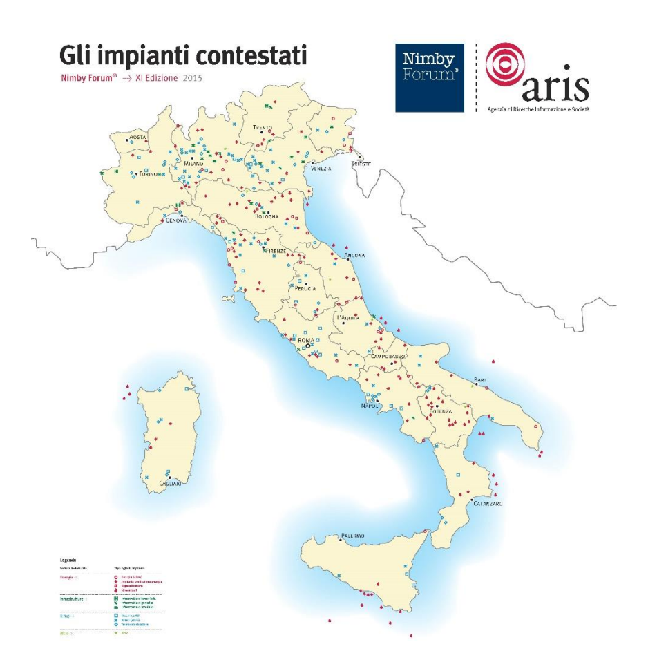
Figure 1 – Contested installations.

The Nimby Forum's<sup>16</sup> annual report published at the end of 2017 (Nimby Forum, 2017) noted and confirmed a significant growth in territorial protests against large-scale infrastructure projects in Italy over the last decade. These environmental campaigns<sup>17</sup> have more than redoubled un amount: from 130 contested installations in 2004 to 359 today (Nimby Forum, 2017). From an observation of the territorial allocation of these campaigns as is shown in the following map (Figure 1), it is possible to point out that they are broadly dispersed all over Italy.