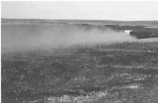
Relatively alkaline (pH ca. 8.0) road dust, as seen here on southern Yamal, July 1995, alters substrate chemistry and patterns of nutrient content in vascular and non-vascular plants which serve as reindeer forage. Road dust has also been reported to significantly reduce the production of cloudberry ( Rubus chamaemorus ) fruits and mushrooms in the mires adjoining the main transport corridor on southern Yamal (see Klein, this issue).