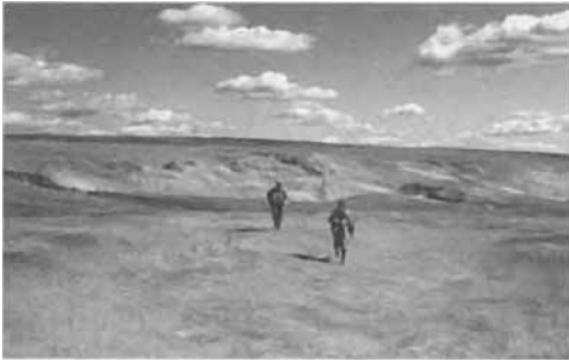
Such sites as this abandoned gas test well, central Yamal Peninsula, June 1993, are widespread throughout Yamal and are problematic for several reasons: (i) slow revegetation due to dry, nutrient-poor and unstable sand surfaces; (ii) deflation of sand/dust to the surrounding area, resulting in the rapid burial of tundra vegetation; (iii) toxic drilling muds often left on the surface; and (iv) rusted metal, broken glass and other trash which can injure reindeer's hooves.