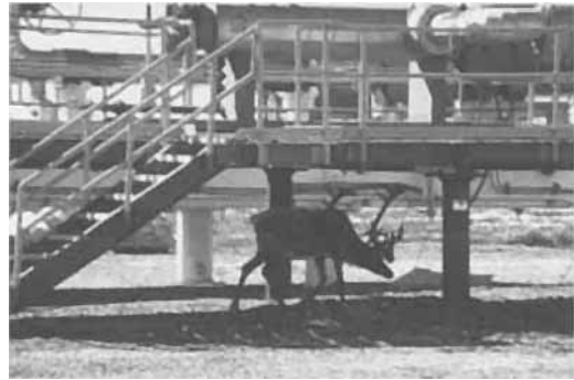
A Central Arctic Herd caribou bull escapes the summer heat in the shade of an oil processing facility at Prudhoe Bay, Alaska. While caribou cows generally avoid oil fields during calving, animals commonly utilize building shade and raised gravel pads for insect and heat relief in the summer.