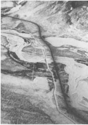
Dust travels up to 1 km from the Haul Road in northern Alaska, spring 1994. It settles on the snow surface where it has several effects, including reducing albedo (surface reflectance) leading to early melting in springtime and excessive thawing of frozen ground.