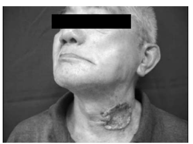
Figure 1 A. A prominent ulcer is noted on level III-IV region of the neck on the left overlying the sternocleidomasoid muscle.