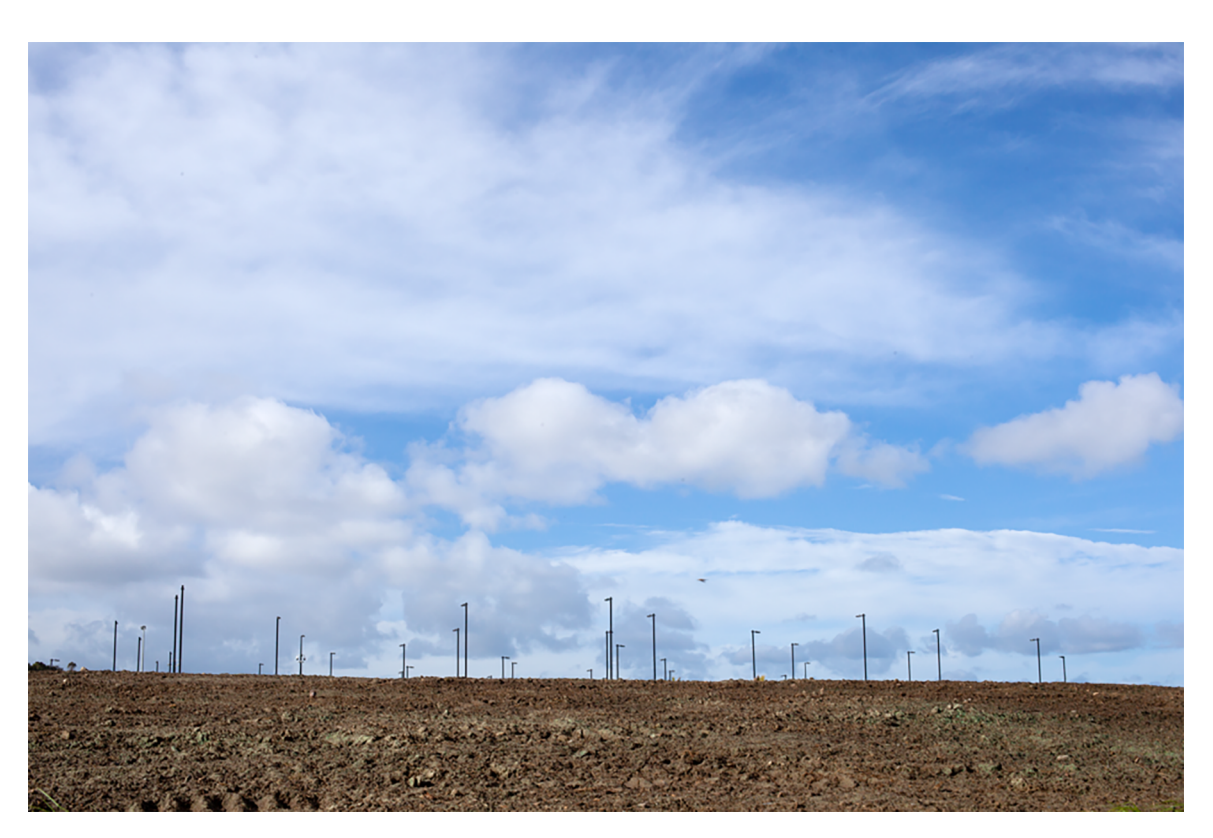
He Puke, He Para, 2021, C-Type Print.