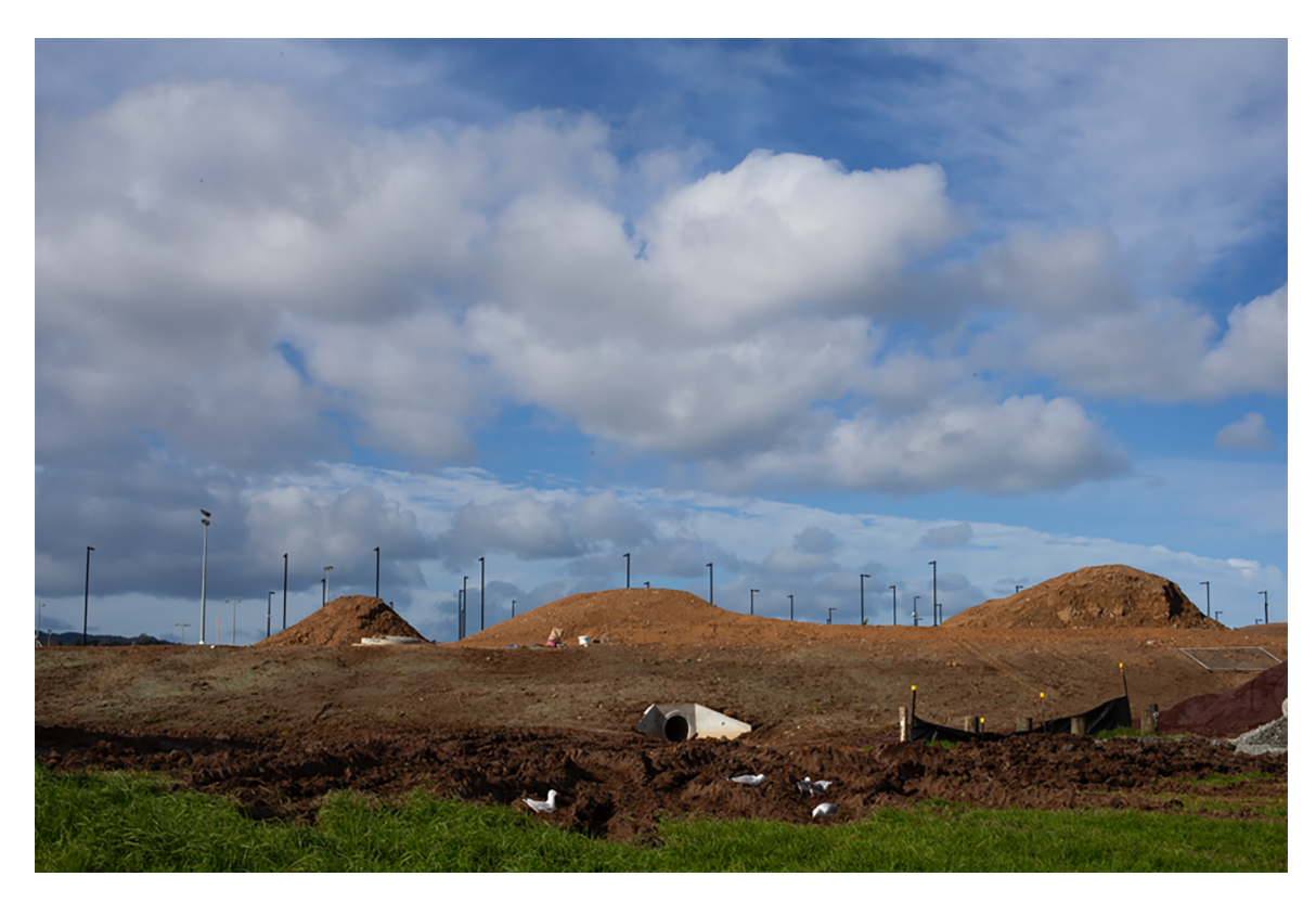
The Safe Treatment of Leachate is Crucial to the Success of Any Landfill, 2021, C-Type Print.