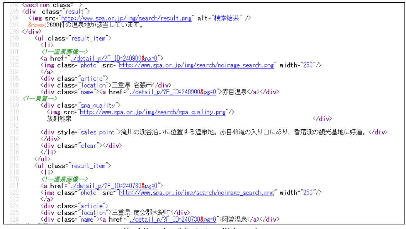
Fig. 1 Example of displaying a Web page's source

There was a need to analyze the data structure of Web pages and identify the data obtained. This can be done using the View source" feature of a Web browser (Fig. 1).