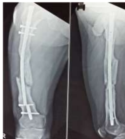
Fig. 7 (a): AP and Lateral radiographs of femur with broken nail

We used this technique in twelve patients who had disturbed union with broken intramedullary nails (Table 1). These broken nails were extracted from March 2012 to February 2015. In all the 12 patients, the broken nail was extracted easily by this innovative technique developed at our institution without opening the fracture site and without disturbing whatever callus was present in the process of union. All these patients, after extraction of broken nail were managed by exchange nailing with one size larger nail after reaming of the medullary canal (Fig. 7a, Fig. 7b).