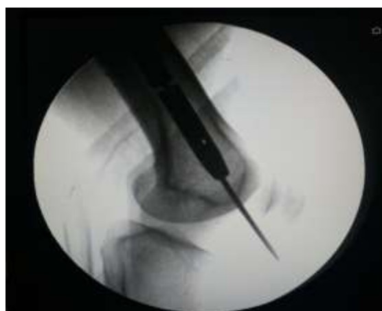
Fig. 3(b): A C-arm Lateral image of exiting the guide wire out of the knee

Now the tip of the wire is doubled over itself to make a loop of the wire at its terminal end, so that it may behave like a ball tipped guide wire (Fig. 4, Fig. 5).