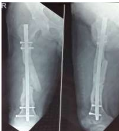
Fig. 7 (b): AP and Lateral radiographs of femur after exchange nailing

None of these patients developed heamarthrosis after the extraction of the broken nail by this technique and also there was no compromise in the pre nail extraction knee range of motion, and/or function (Table 1). None of the patient developed any sign of early or delayed infection and there was no impairment of knee function in any of the patient at the final follow up. All patients achieved union after exchange nailing within a mean period of 19.8(16-24) weeks (Table 1). Mean follow up period after exchange nailing was about 20.3 (range 18-24) months (Table 1).