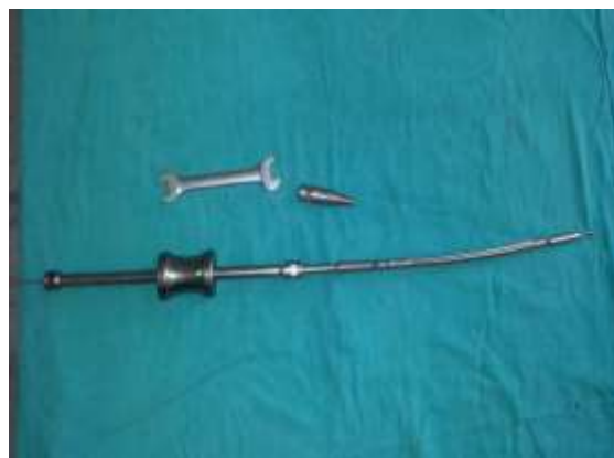
Fig. 6: Extracted both pieces of broken nail together with the help of a doubled up tip guide wire

The patellar tendon is then split slightly at a point of wire protrusion and is widened slightly by a hemostat to pull the wire proximally avoiding damage to the tendon. The wire is then pulled back proximally into the lower end of the femur till it gets stuck up at the end of the distal piece of the broken nail. The knee is then extended and the foot of the limb is again secured into the foot holder of the fracture table. Now a cannulated extractor of the femoral nail is threaded over the proximal portion of the guide wire and is screwed tightly into the proximal end of the femoral nail. The entire nail is then pulled out by gentle blows of the extractor hammer while one of the assistant keeps pulling the guide wire tightly and proximally with every blow of the extractor hammer. Both the pieces of the broken nail are thus extracted together easily and safely (Fig. 6).