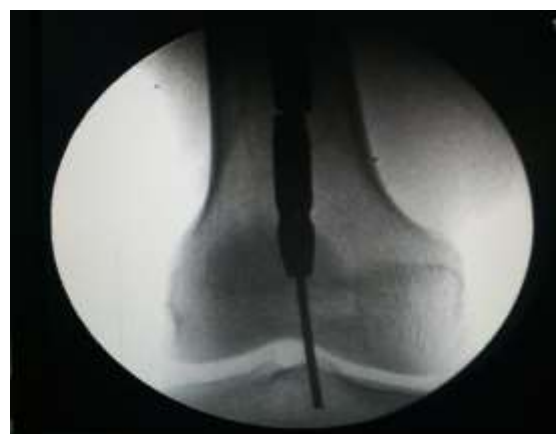
Fig. 3(a): A C-arm AP image of exiting the guide wire out of the knee