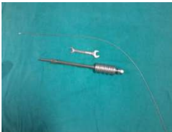
Fig. 1: A standard guide wire and a cannulated extractor