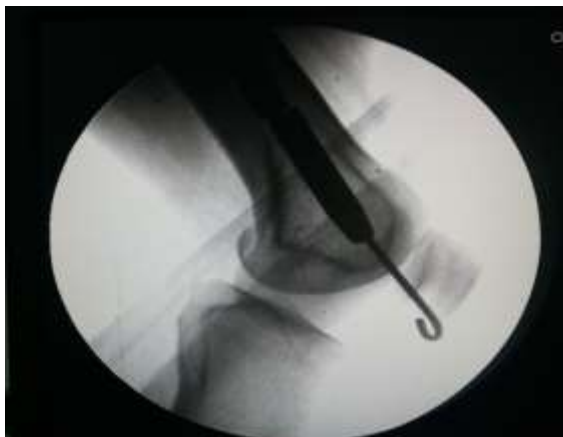
Fig. 5: A C-arm image of doubled up tip of the exited wire

The patellar tendon is then split slightly at a point of wire protrusion and is widened slightly by a hemostat to pull the wire proximally avoiding damage to the tendon. The wire is then pulled back proximally into the lower end of the femur till it gets stuck up at the end of the distal piece of the broken nail. The knee is then extended and the foot of the limb is again secured into the foot holder of the fracture table. Now a cannulated extractor of the femoral nail is threaded over the proximal portion of the guide wire and is screwed tightly into the proximal end of the femoral nail. The entire nail is then pulled out by gentle blows of the extractor hammer while one of the assistant keeps pulling the guide wire tightly and proximally with every blow of the extractor hammer. Both the pieces of the broken nail are thus extracted together easily and safely (Fig. 6).