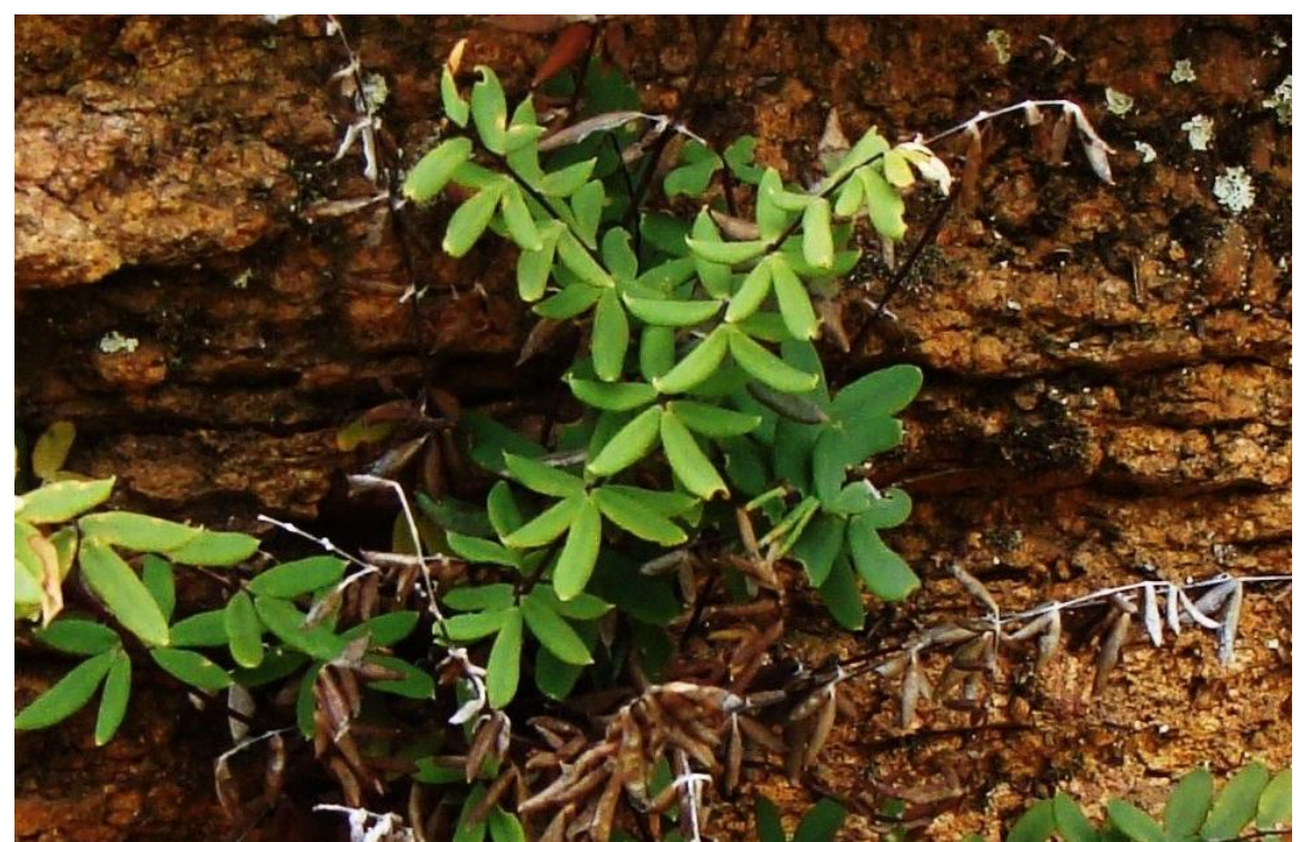
Figure 8 Pellaea wrightiana growing on granite rock in Great Plains State Park