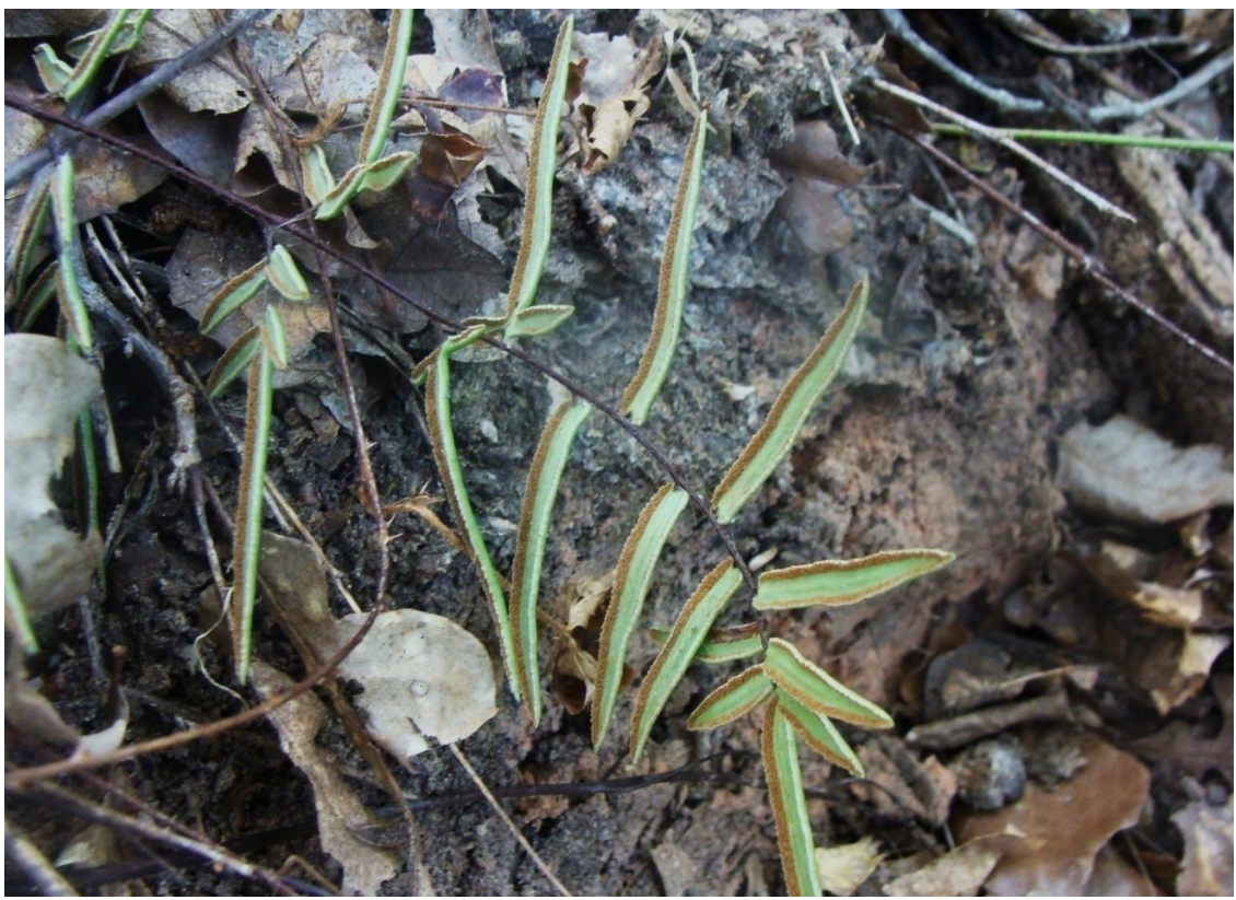
Figure 1 Marginal sori, Pellaea atropurpurea