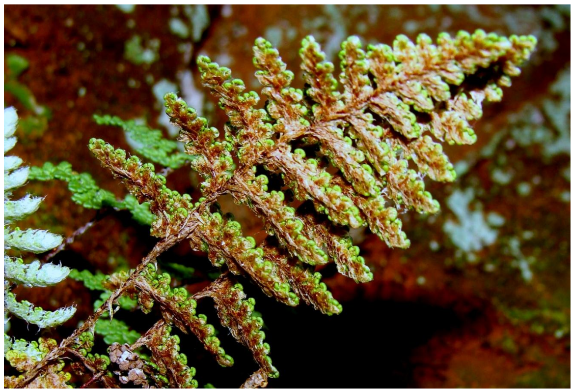
Figure 3 False indusium, Cheilanthes wootonii