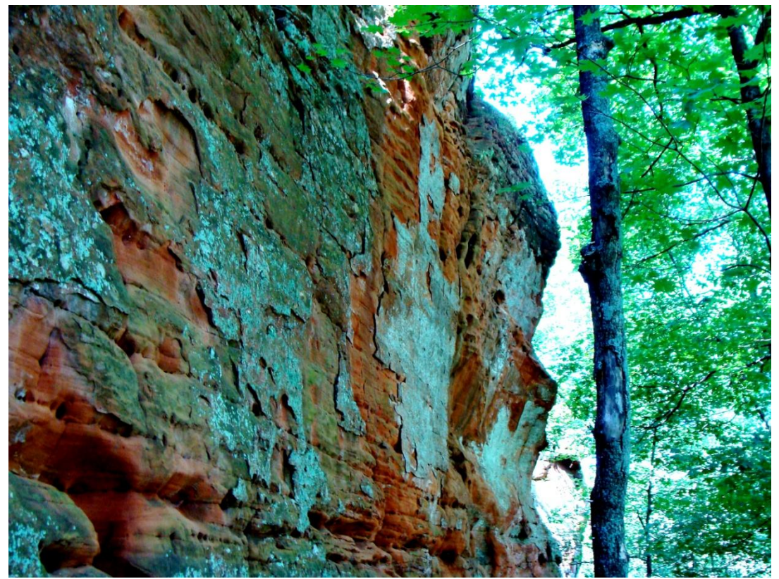
Figure 12 Red sandstone rock in the Caddo Hills