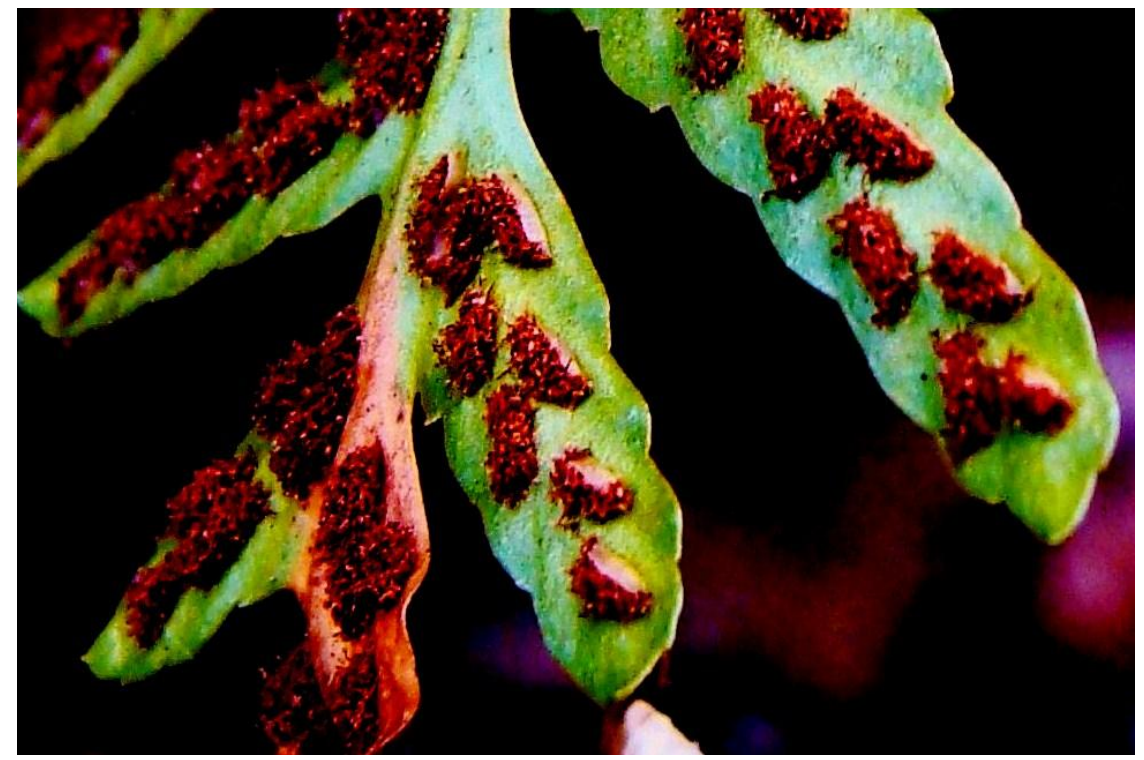
Figure 2 True indusia attached along the sides of the sori, Asplenium (spleenwort)