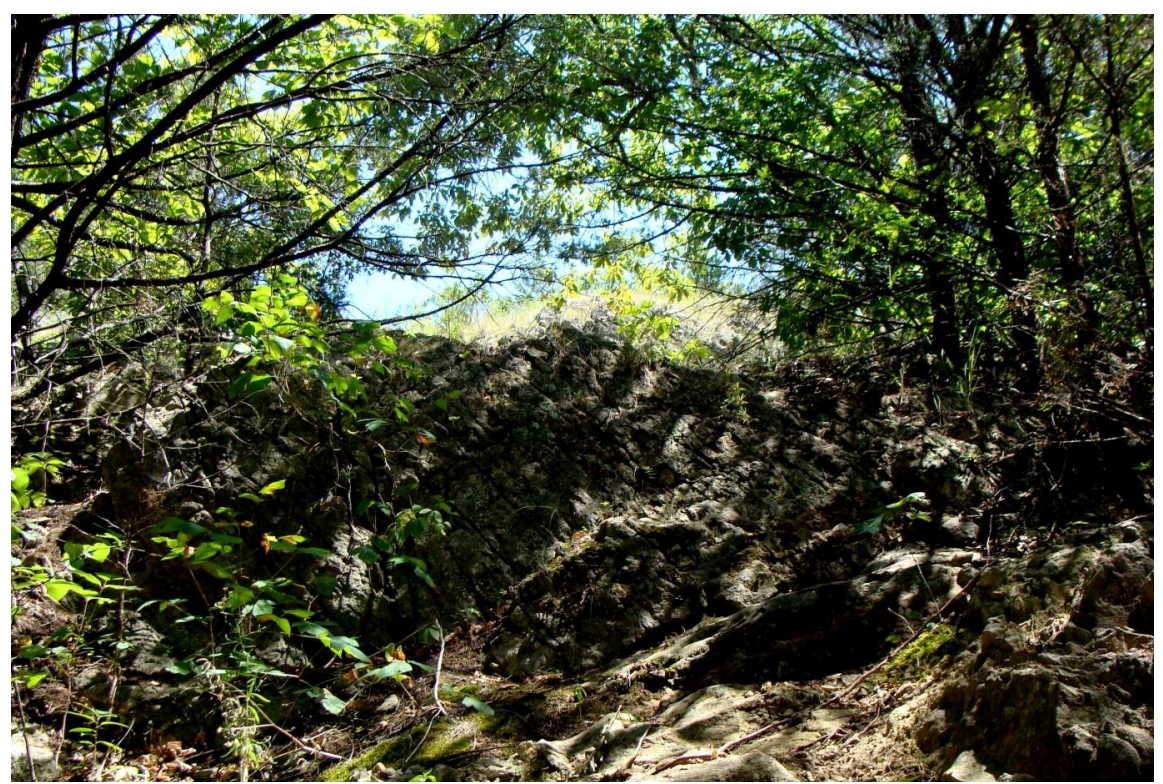
Figure 9 Limestone rock in the Arbuckle Mountains