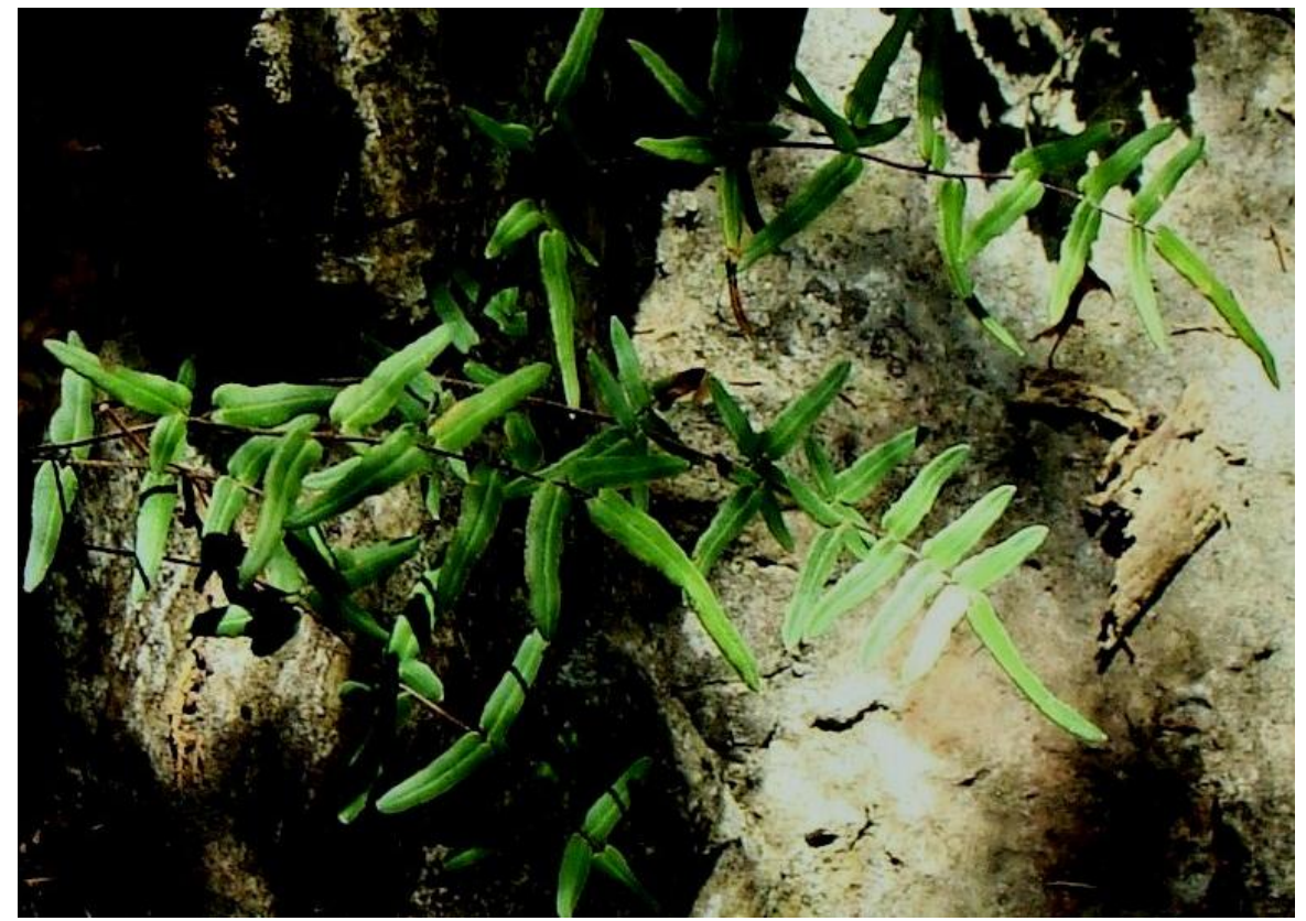
Figure 4 Pellaea atropurpurea, the most common species of pteridaceae in the Oklahoma.