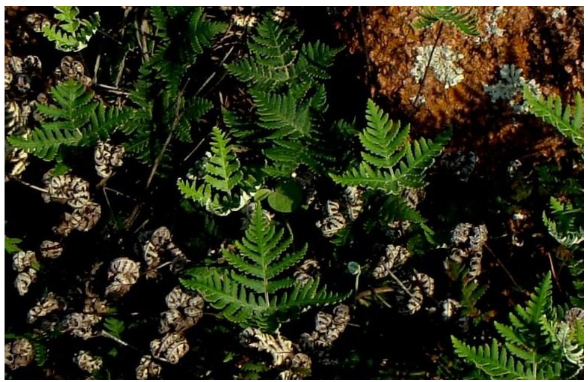
Figure 7 Notholaena standleyi growing on granite rock in the Wichita Mountains