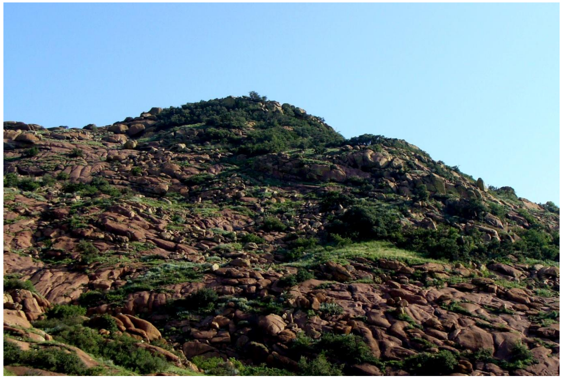
Figure 10 Granite rock at Quartz Mountain Resort Park in the western part of the Wichita Mountains.