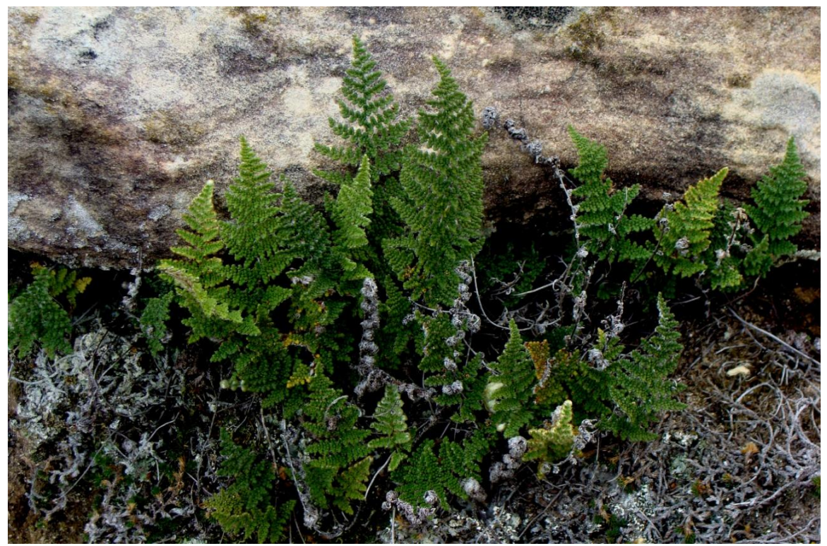
Figure 6 Cheilanthes wootonii growing on sandstone rock in Cimarron County