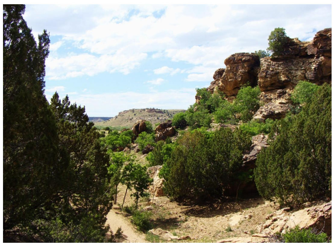
Figure 11 Sandstone rock on the Hoot Owl Ranch in Cimarron County (Black Mesa area)