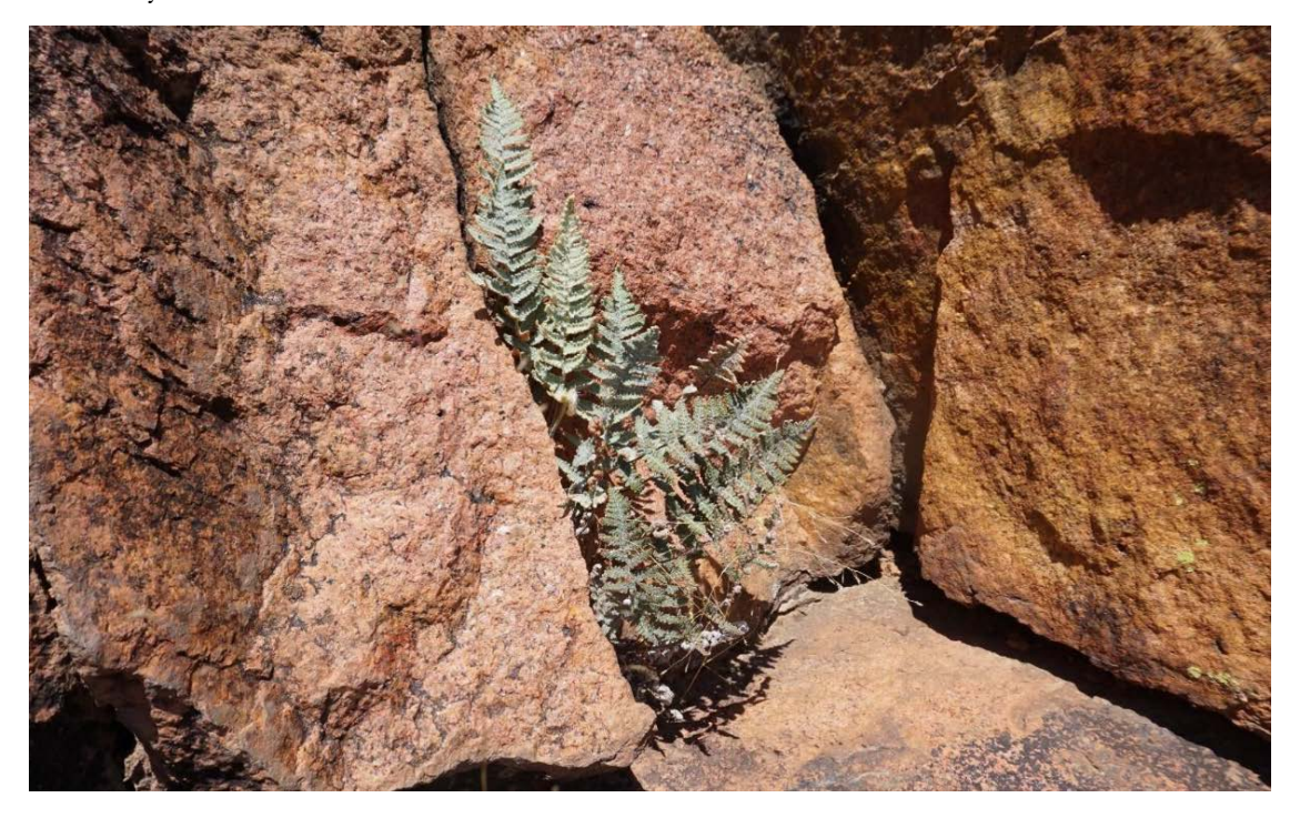
Figure 6 Myriopteris lindheimeri growing in an open granite rock crevice on Lindheimer's Mountain, Southwest Baptist Youth Camp.