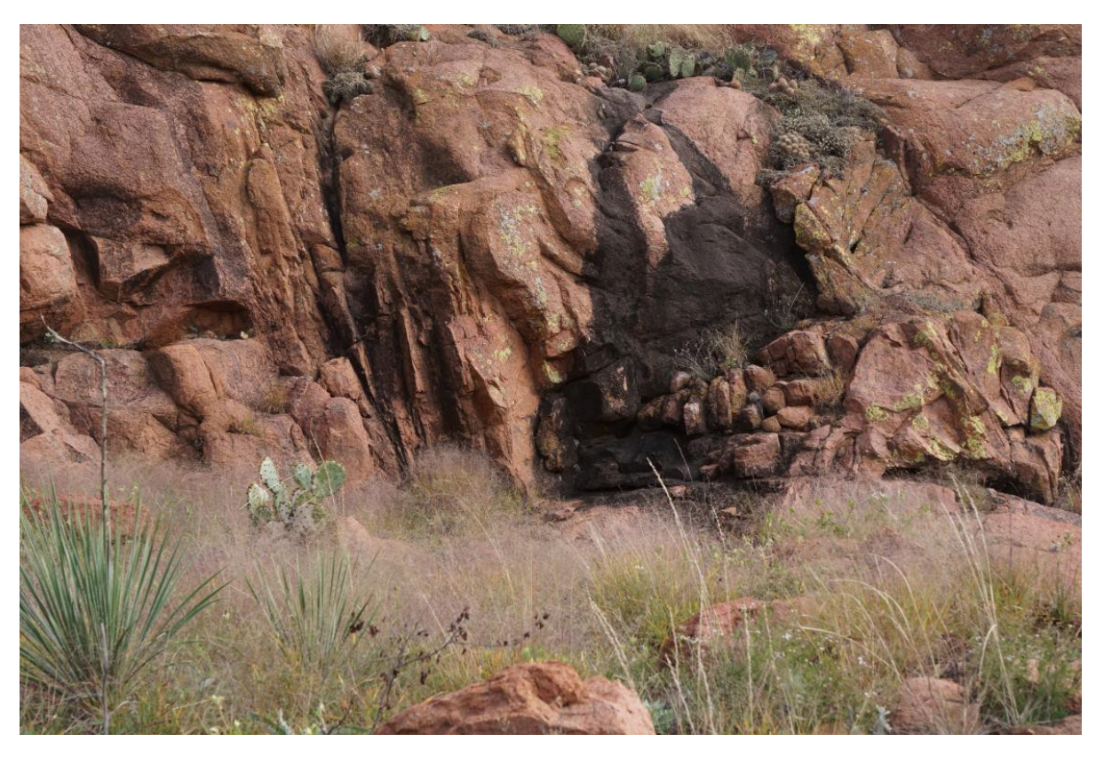
Figure 1 Lindheimer's Mountain (name given by the author), Southwest Baptist Youth Camp, near Quartz Mountain Resort.