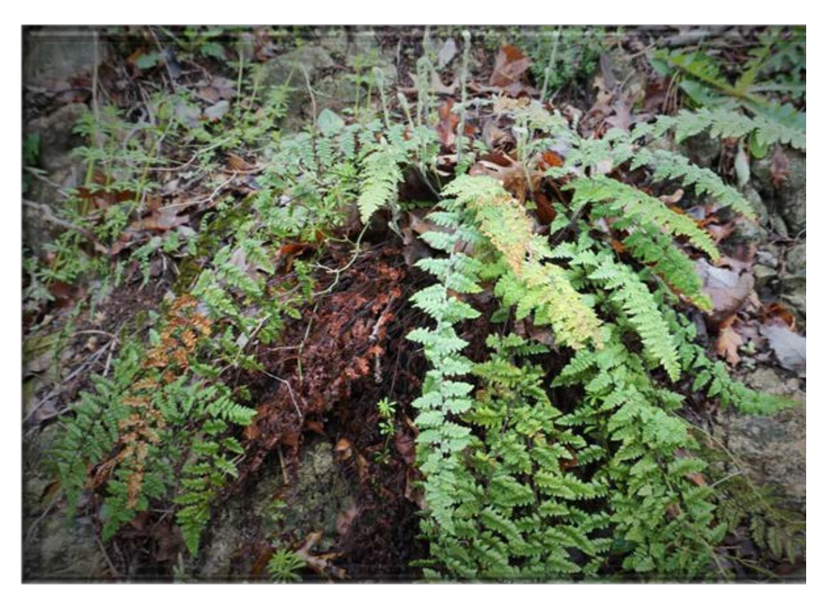
Figure 5. Myriopteris tomentosa , wooly lip fern. Rhizomes short creeping, fronds clustered.