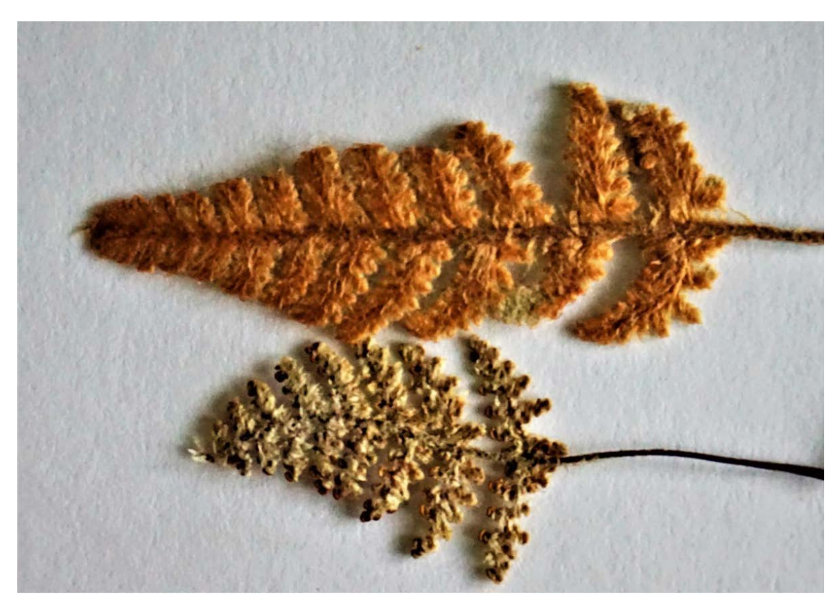
Figure 7 Abaxial surfaces of M. lindheimeri (top) and M. wootonii (bottom). Note the revolute margins (false indusia) hidden or partially hidden by scales on M. lindheimeri .