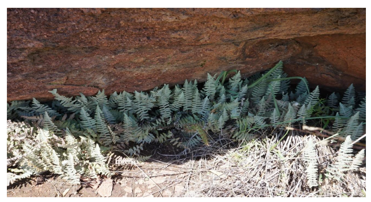
Figure 2 Myriopteris lindheimeri (= Cheilanthes lindheimeri), fairy swords, growing under a granite rock overhang on Lindheimer's Mountain, Southwest Baptist Youth Camp. Note the long stretching rhizome, separate erect fronds, and adaxial surfaces appearing tomentose.