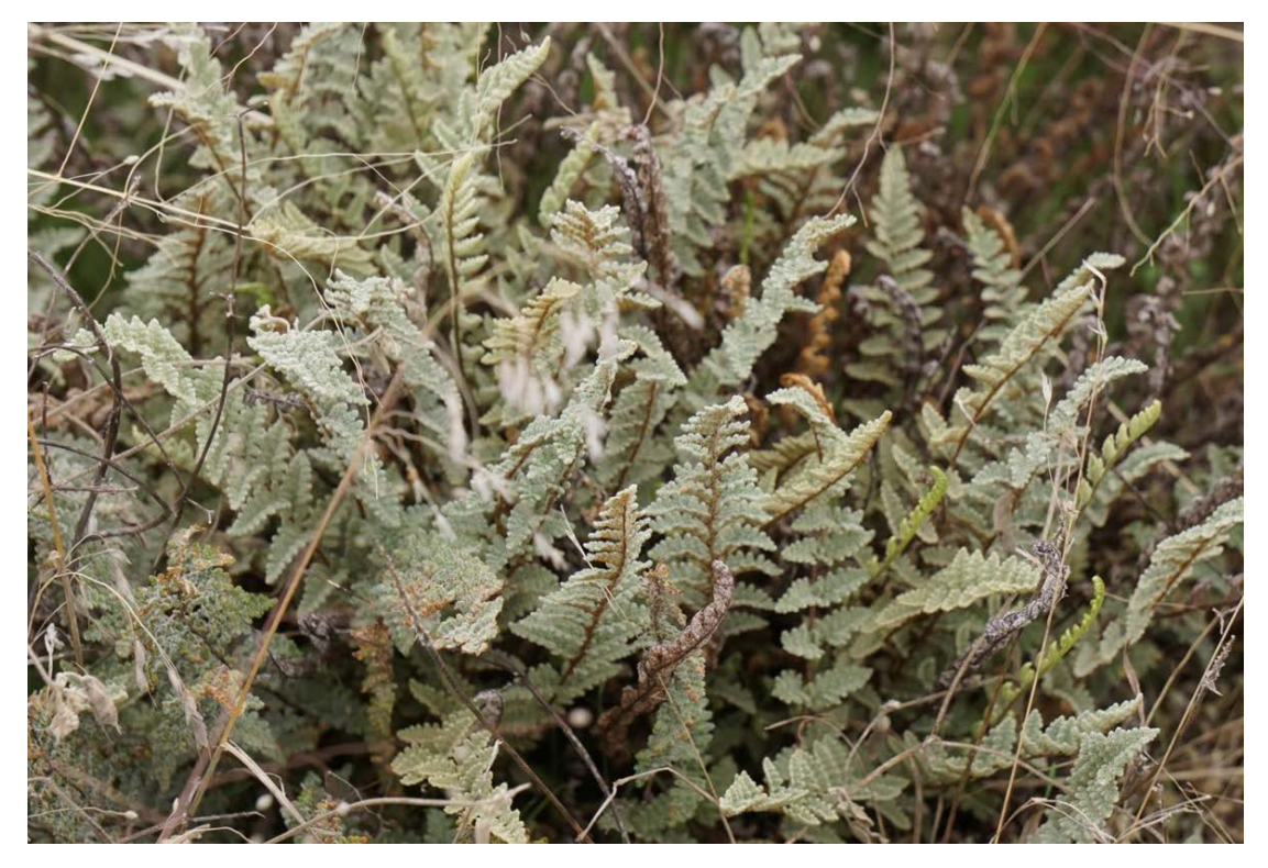
Figure 4 Myriopteris rufa , Eaton's Lip fern, on Headquarters Mountain Hiking Trail in Granite, Oklahoma. Note the clustered fronds and the white hairs on the blade surfaces.