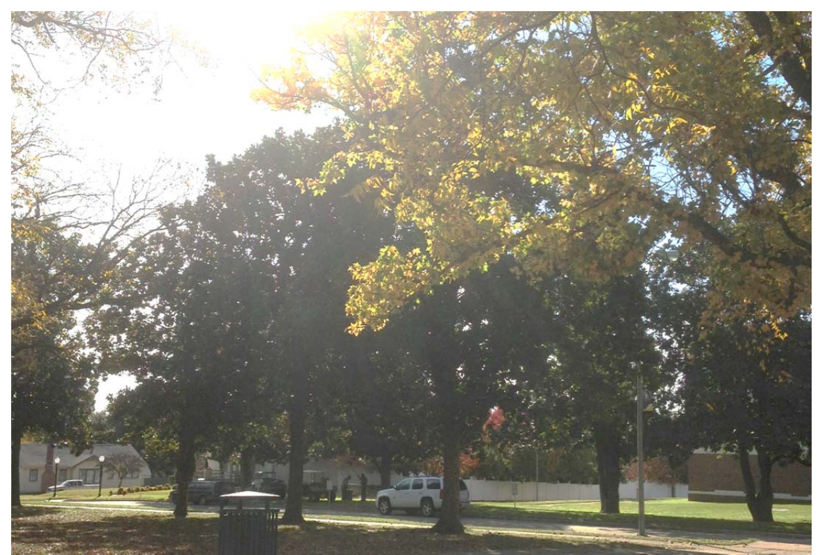
Figure 1 The general habitat of the trees used in this study in November 2013

(Fig. 3). We also changed the water and cleansed the cut ends of the twigs with a brush to prevent decomposers, living off of sap, from blocking the xylem. Eighteen of the original 90 twigs failed to burst their buds during this experiment and were presumed dead.