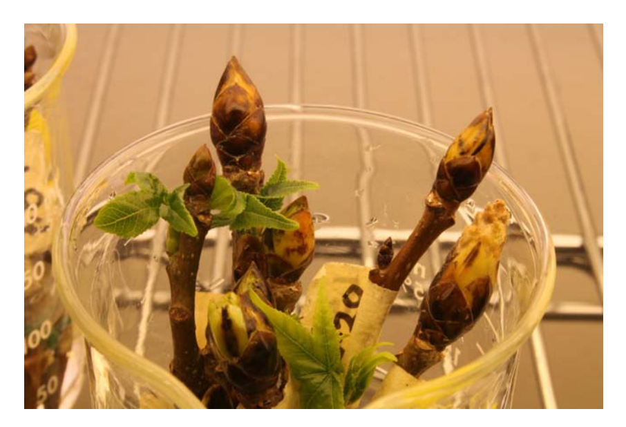
Figure 3 Buds of sweetgum ( Liquidambar styraciflua) at various stages of budburst. The top bud has not yet opened, and the bud at the lower right is just beginning to open.

Figure 2 Average first and last freeze dates in Oklahoma, 1961-2010 average. Maps modified and used with permission from Oklahoma Climatological Survey (http://climate.ok.gov/index.php/climate).