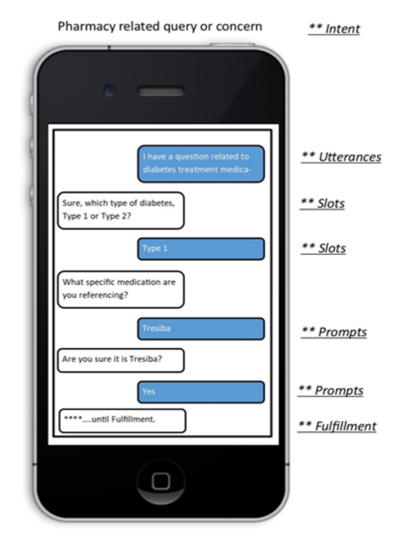
Figure 1. Example of Bot Development Terms.

AWS Lex provides an easy-to-use Amazon console where the user would define bots, intents, and Slot types. The bot performs the automated tasks, such as guiding a customer through ordering a pizza. It is powered by the Automatic Speech Recognition (ASR) and Natural Language Understanding (NLU) capabilities, the same technology powering the Amazon Alexa. The intent represents an action a user would like to perform. A bot can support one or more related intents. In our pizza example, a developer can create a bot that also orders drinks. Intents can utilize zero or more slots or parameters. Adding slots is part of the intent configuration. During runtime of the chatbot application, Amazon Lex prompts the user for specific slot values. The user must provide values for all minimally required slots before Amazon Lex can fulfill the intent. Each slot will include a type, and for this the user creates his or her custom slot types or can use built-in slot types available with Amazon.