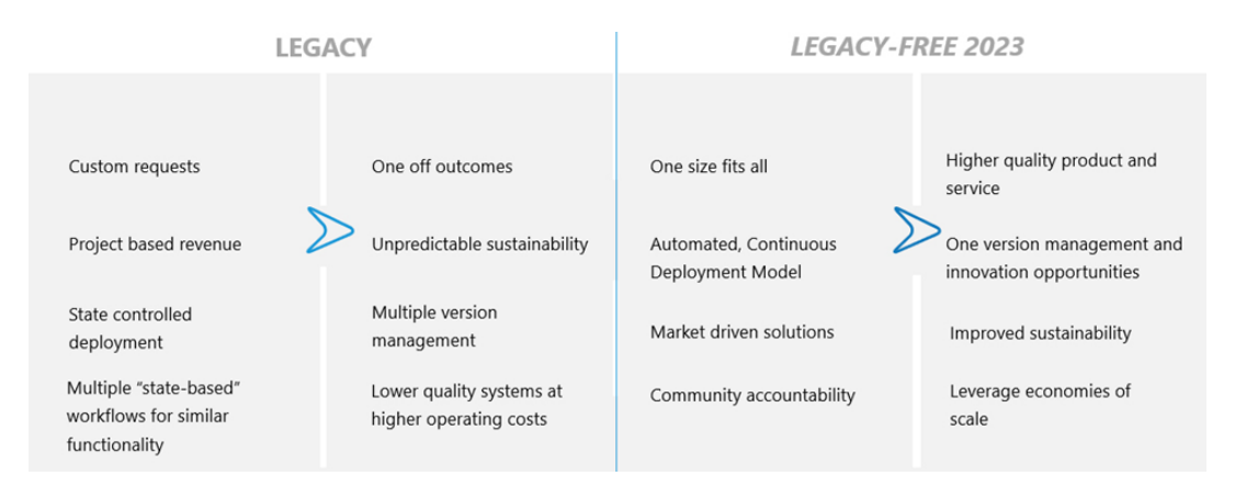
Figure 2: Creating a 3<sup>rd</sup> Generation IIS Requires a Community and Engaged Consortium Approach

Step one in the process has been for the Consortium to support the move from traditional state government "on premise" servers to private, cloud-based hosting services. This creates the opportunity for DevOps team to deliver updates faster across each system and in real time add capacity to ensure performance under any user demand. This is only step one. A complete modernization of the architecture and software tools for the IIS is required. The role of the collaborative as a shared commitment is to oversee modernizing the user experience, improved work flows and set priorities for feature function removal, updates and delivery.