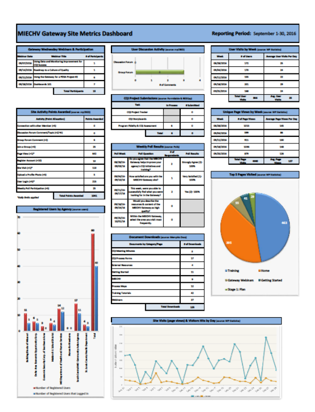
Figure 4, MIECHV Gateway Site Metrics Dashboard, September 2016

At the conclusion of the contract period (09/30/2016), a total of 60 users (46 LIAs; 14 MoDHSS) were registered with 40 active users (66.7% adoption rate). The site averaged 29 page views per day, awarded 3,178 site activity points, and had 540 document downloads. The Training page was most frequently visited by users. In regards to social media engagement, at the end of the contract period, there were no members or followers (other than Gateway administrators) to any of the three social media sites. Further surveying of LIA users is necessary to determine if users utilize social network sites, access social media sites in the workplace, access internet and internet-accessible devices at both work and home, and share opinions on using social media for business/employment purposes.