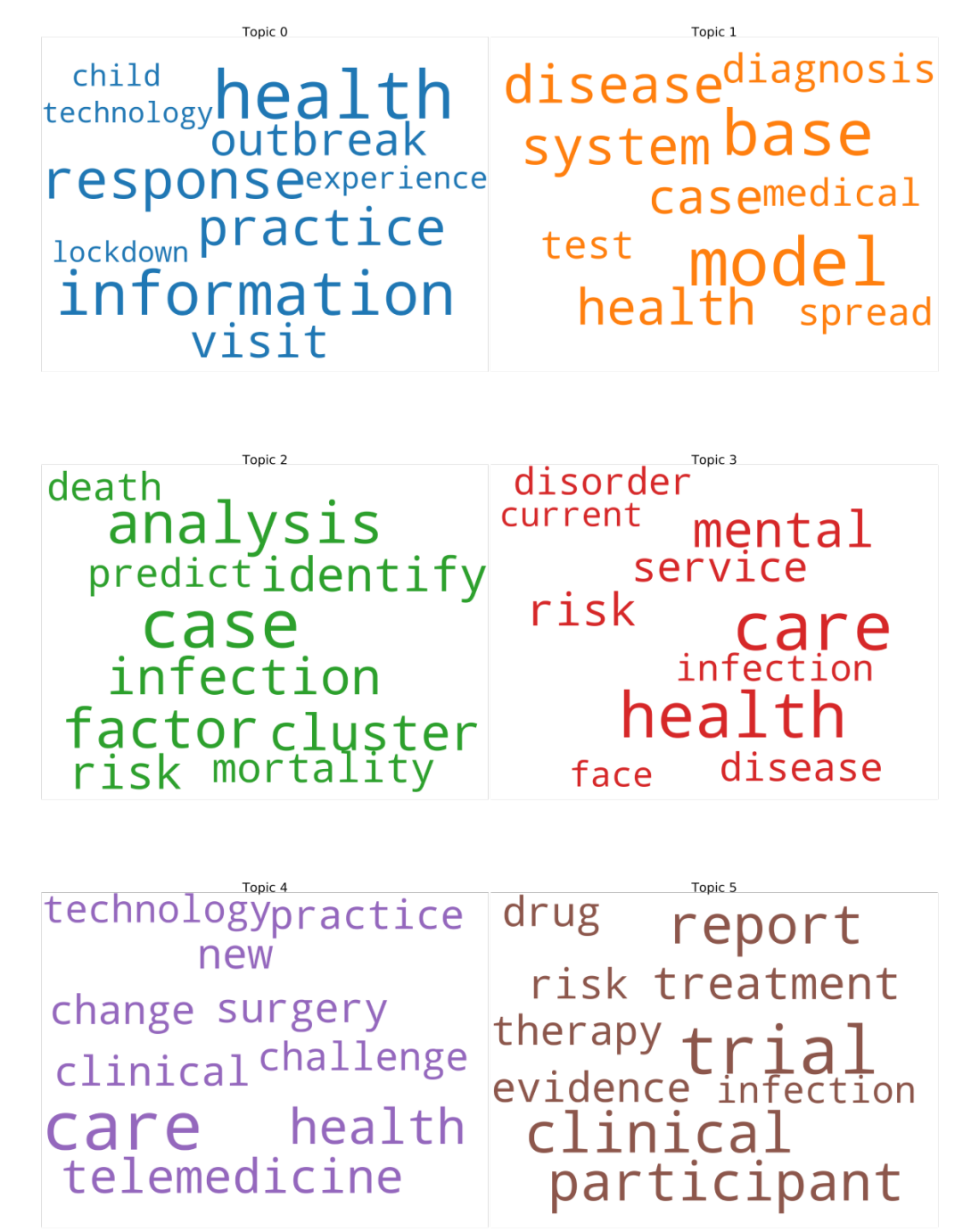
Fig.1. Word cloud of topics of articles published in health information technology and COVID-19.

Figure 1 also illustrates the ten most important words of each topic in the form of word clouds. In a word cloud, the words with larger fonts are more important and useful in the related topic.