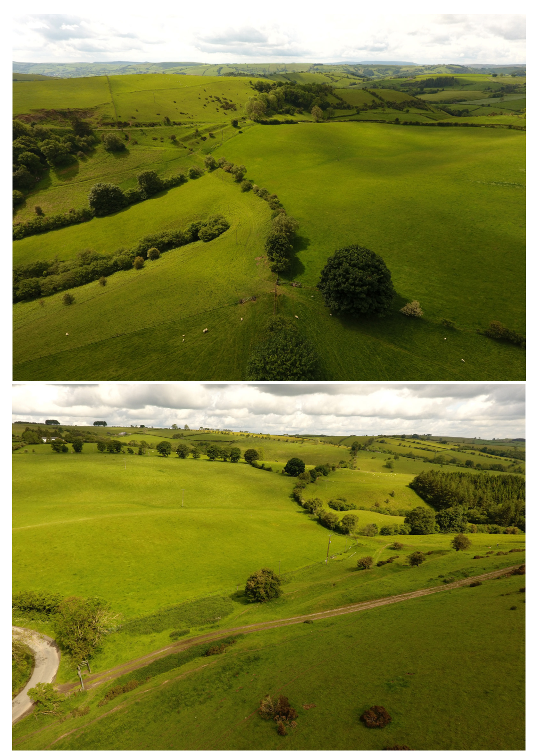
Figure 5: Two drone photographs of Hergan Corner (Clun Forest, Shropshire), where Offa's Dyke follows an angled turn, perhaps to assist with the surveillance and control of a possible gateway (Ray and Bapty 2016: 228–232, 237), looking south (above) and north (below)