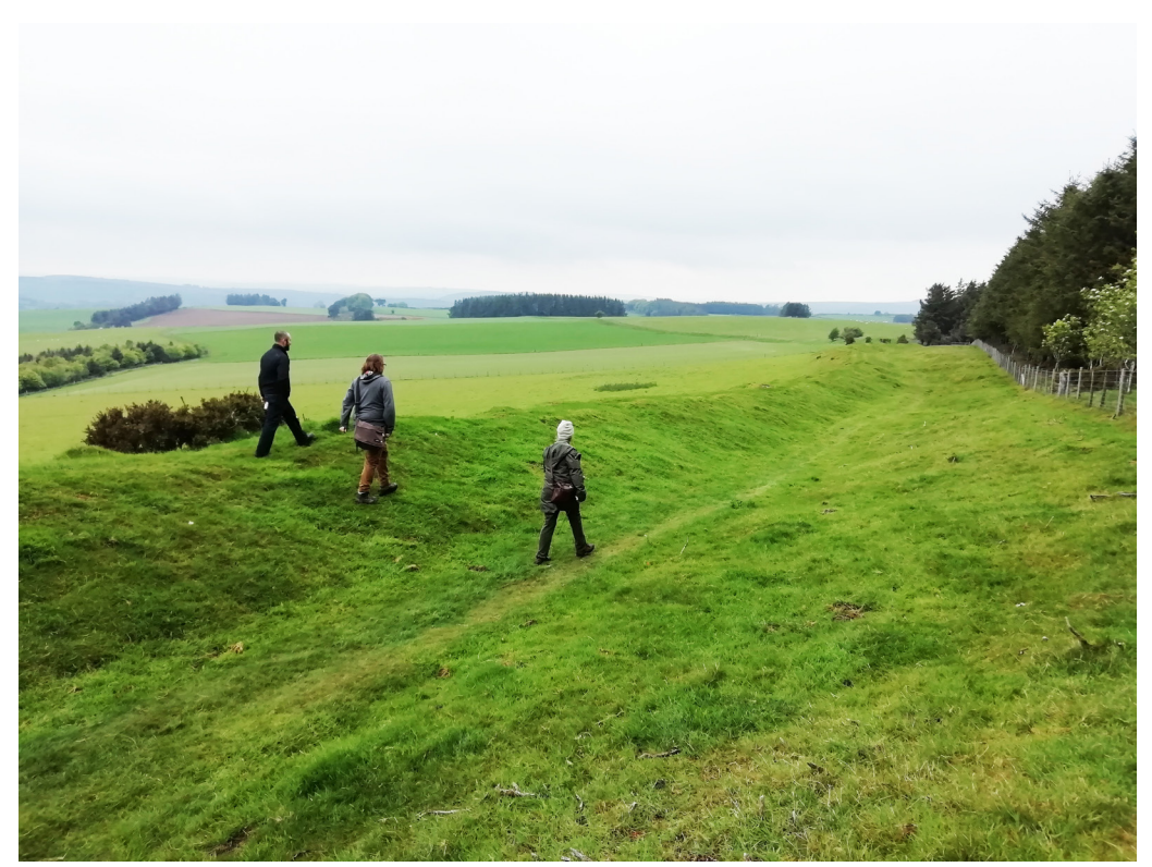
Figure 6: Looking north along Offa's Dyke at Hawthorn Hill, Powys, where the ditch has long been denuded but the quarry ditch to the east of the bank is well preserved (see also Ray and Bapty 2016: 190–192).

of the Gloucestershire earthwork in Offa's Dyke (Bapty 2004; Ray and Bapty 2016: 82–91; 191–92: see also Fox 1955: 277) (Figure 6). Indeed, part of the Gloucestershire section is actually called Offedich in a deed of 1321 (Hare 2004: 206), and though this is by no means conclusive, it should be recalled that the only pre-Conquest reference to the Dyke occurs in the survey of the Gloucestershire estate at Tidenham (Sawyer 1968: no. 1555). Perhaps we should envisage Offa building two dykes, one in southern and central Gloucestershire, the other in the central regions of the Welsh marches (Hare 2004: 206).