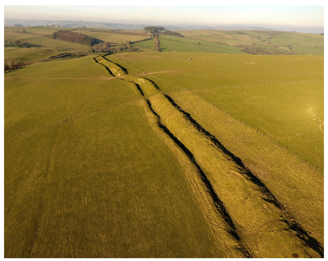
Figure 2: Drone photograph looking north over Offa's Dyke from Llanfair Hill to Spring Hill Farm, Shropshire, showing (from left to right) the counterscarp bank to the left, the ditch, the bank and traces of quarry ditches to the right

a number of conundrums. It is difficult in the extreme to answer the questions which the existence of the Dyke raises: who ordered it to be built, for what purpose, how was the labour involved recruited and organised, and how was it used? The period to which it is attributed is one for which the historical sources, both for Wales and for England, are minimal. The archaeological record is scarcely better, since the regions which the Dyke traverses are, for the relevant period, largely aceramic and coinless, depriving us of two major means of dating the structure (Figures 2–3). Moreover, since no scrap of timber or wood has been recovered from the Dyke itself, the use of dendrochronology is precluded. The tasks of both historians and archaeologists are thus rendered even more arduous than is commonly the case. I am an historian, not an archaeologist, and my specialist field is the tenth and eleventh centuries, not the eighth and ninth. I have therefore no view of my own to present on Offa's Dyke. This may, however, be an advantage, since I also have no axe to grind. What I propose to do in this paper is lay out some of the problems which the Dyke presents, and summarise (I hope accurately) current thinking on them.