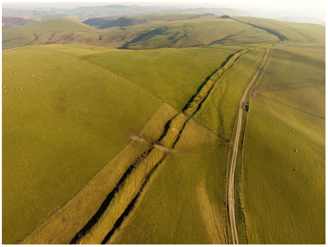
Figure 3: Drone photograph looking south from Llanfair Hill over Offa's Dyke towards Cwmsanahan Hill

Alfred, written soon after 893, and thus a century after the death of King Offa in 796 (Keynes and Lapidge 1983: 71):