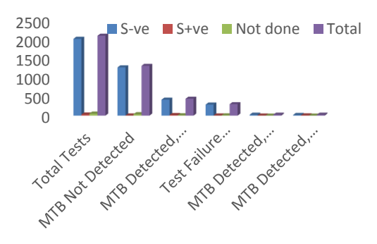
Figure 2: MDR Pattern in TB Patients

Direct sputum microscopy is popular worldwide. In Nepal, the Tuberculosis diagnosis and monitoring rely in Sputum microscopy because of its low cost and easier to perform. At present there are 533 microscopy centres catering the sputum microscopy examination throughout the country. The region wise distribution is given in Table 1 . Most of the microscopy centres are established in government setting and few are established in nongovernmental organization and private sectors. NTC-National