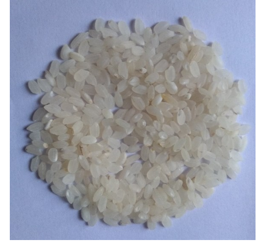
Photograph 3. Taichin rice (Taichung-176)