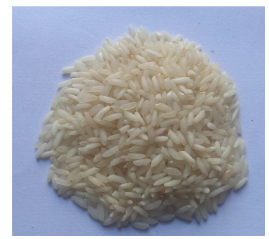
Photograph 2. Khumal-4 rice variety