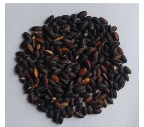
Photograph 1. Black rice variety

was 8.13± 0.01%. The DPPH radical scavenging activity was found higher in BR variety (59.02 to 75.52%) with the highest observed in aromatic black rice Poireiton chakhao (75.52%) <sup>[26]</sup>. Another study reported that the DPPH scavenging activity of red rice, parboiled rice, and Sona Masuri were 57.06%, 9.13%, and 16.38%, respectively [18,29].