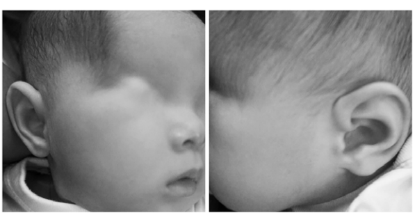
Figure 2: Right and left ear