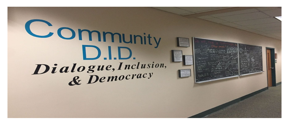
FIGURE 2. Dialogue, inclusion, and democracy wall at Providence College

As a practical matter, the DID Walls pose regular questions on topical issues that are named and framed for constructive community conversations. The DID Walls use students' and community members' lived experiences and localized knowledge to develop timely and relevant questions regarding current events. Once a question is posted, any member of the PC community can respond with their personal experiences and opinions.