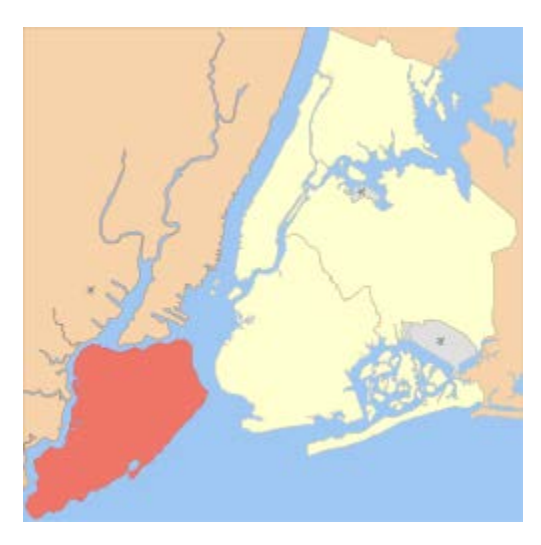
Figure 1. Staten Island, New York.