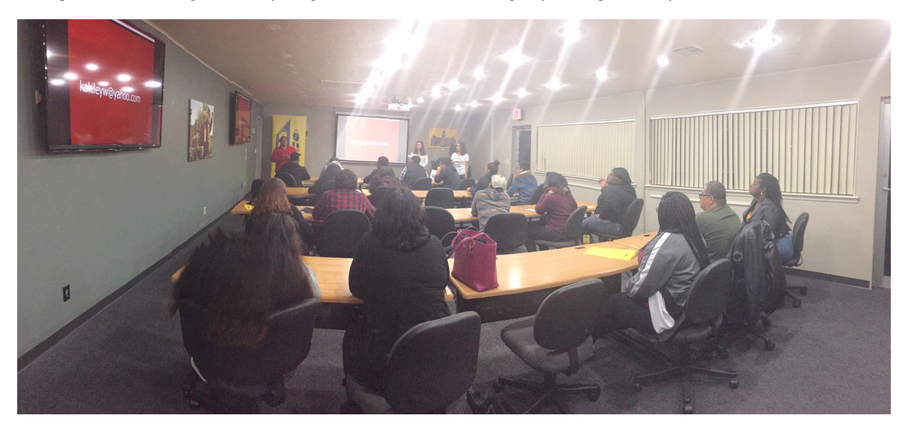
Figure 2. Hispanic students and their parents attended a Gates Millennium Scholarship Application Workshop in November. Conducted by the University of Central Oklahoma, the workshop was held in the UCO conference/classroom located in the Greater Oklahoma City Hispanic Chamber of Commerce. The workshop was one of many addressing college opportunities as well as business development offered through the facility. Programs often are delivered bilingually.