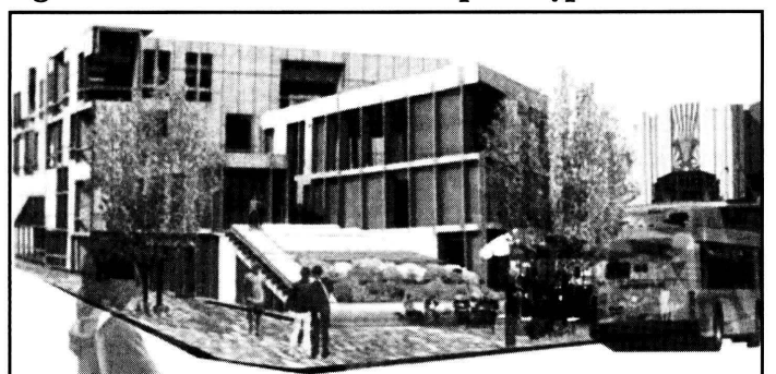
Figure 4. Street corner view of prototype S.

The design includes working family housing (upper left); shops and offices with terracing and sidewalk retail, food and beverage areas; public transit; paving; plants and trees; and an existing historic art deco building (on right). This model