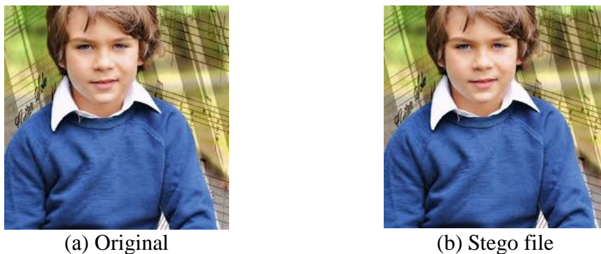
Fig. 1 Visual analysis

It aims to fill almost the capacity of the picture container and examine the new file for visual defects and changes in image color, Fig. 1.