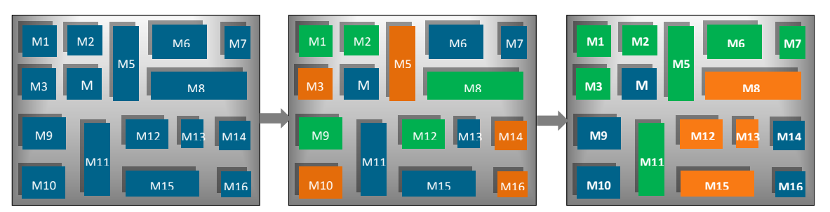
Fig. 1. Periodic test in the field: blue-colored blocks are in idle state, green-colored blocks are in mission and orange-colored blocks are in test mode.

Therefore, advanced methods are applied to divide the test into parts, and each time execute one part of the entire test. This means only a predefined subset of memory cells is tested during each test session. It is important to note that the state after each test session must be saved in the