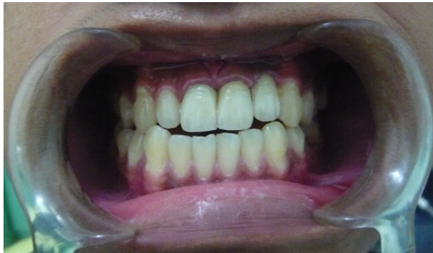
Figure 6. The insertion of porcelain fused to metal crown on teeth #11, #21 and #22.