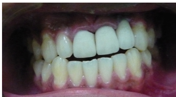
Figure 4. Temporary tooth crown on teeth #11, #21 and #22.

The crowns of fractured teeth #11, #21 and #22 were extracted until the cervical areas and gingivectomy was done in the palatal rugae frenulum areas to improve the shape of excessive gingival contour lines that corresponded to palatal and labial cervical portion of the anterior teeth (Figure 3). After wound healed, an impression were taken on maxillary and mandibula for model study. Dental records