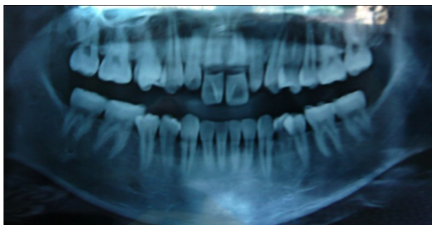
Figure 2. Panoramic x-ray image.