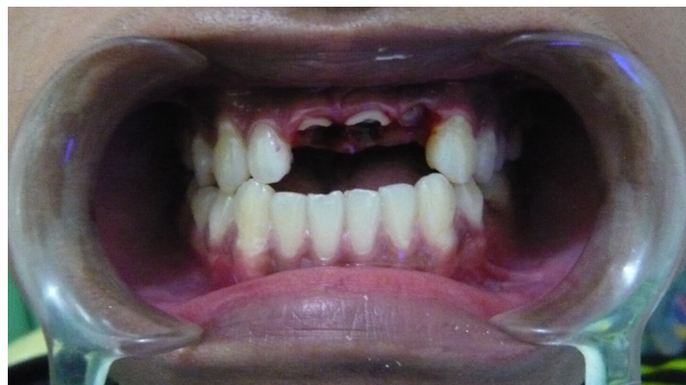
Figure 3. The Condition of teeth after the releasing the crowns of #11, #21, #22 prior to the treatment.

was found around the vestibule areas of the teeth #11, #21, #22 and the upper lip (Figure 1a). The patient wanted to have his anterior teeth aesthetically improved to normalized its form and function.