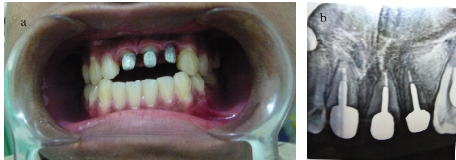
Figure 5. a) The inserted of casting post and core on teeth #11, #21 and #22; b) Casting post and core insertion in the root canal.