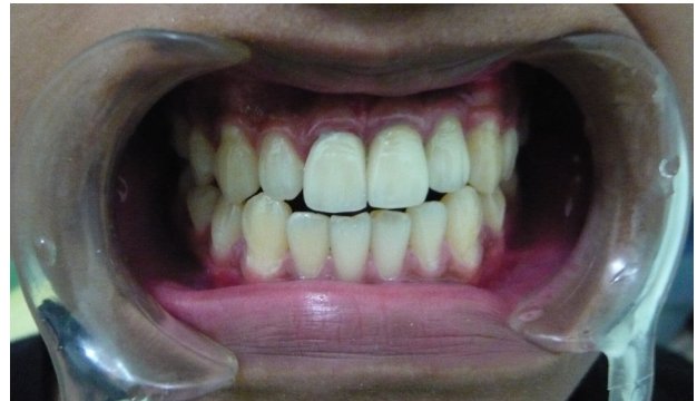
Figure 7. Control after 3 month.

injuries. Fractures that involving the edge of gingiva area need an endodontic treatment followed with crown restorations using post and core but it depend on the age of patient. 5