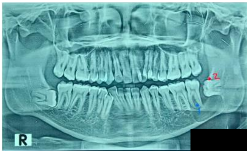
Figure 1. Pre-operative radiograph, location of lesion, and specimen collection point. Blue dot is an ameloblastoma. Red dot is the impacted third molar (#36).

An anatomic pathology examination was conducted using the FNAB method first, revealing a benign cystic lesion with suspicions of an ameloblastoma. Then an incisional biopsy was performed under local anesthesia to confirm a definitive diagnosis (Figure 2).