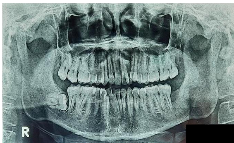
Figure 4. Post-operative panoramic radiograph, in the region of the left mandible.