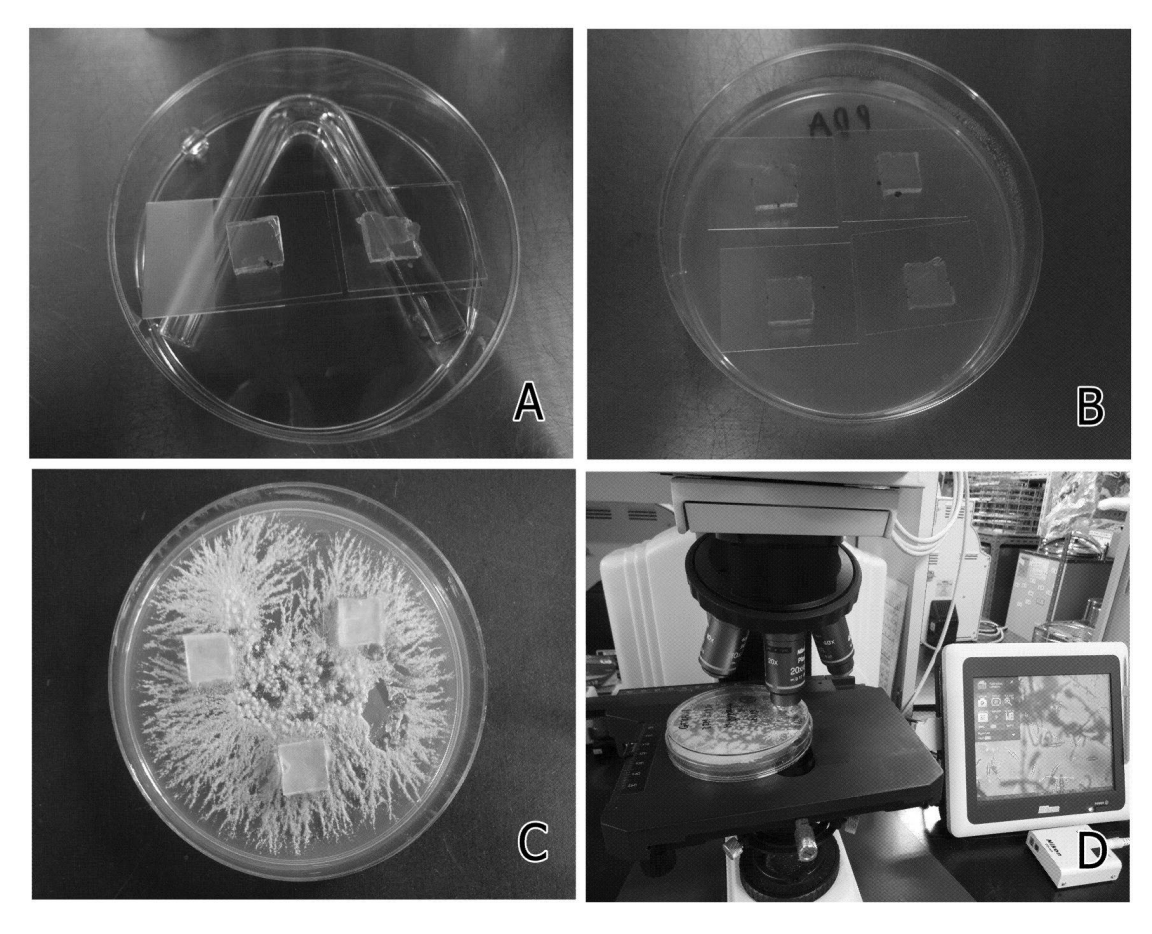
Fig 1 Basic slide culture, agar block PDA on the glass slide put on the bent glass rod (A); Modified slide culture 1, agar block PDA was put on the sterile medium (B); Modified slide culture 2, agar block PDA was put after the growth of the dermatophytes (C); Direct culture on slant agar plate , visualize structure the dermatophytes directly under the microscope (D).