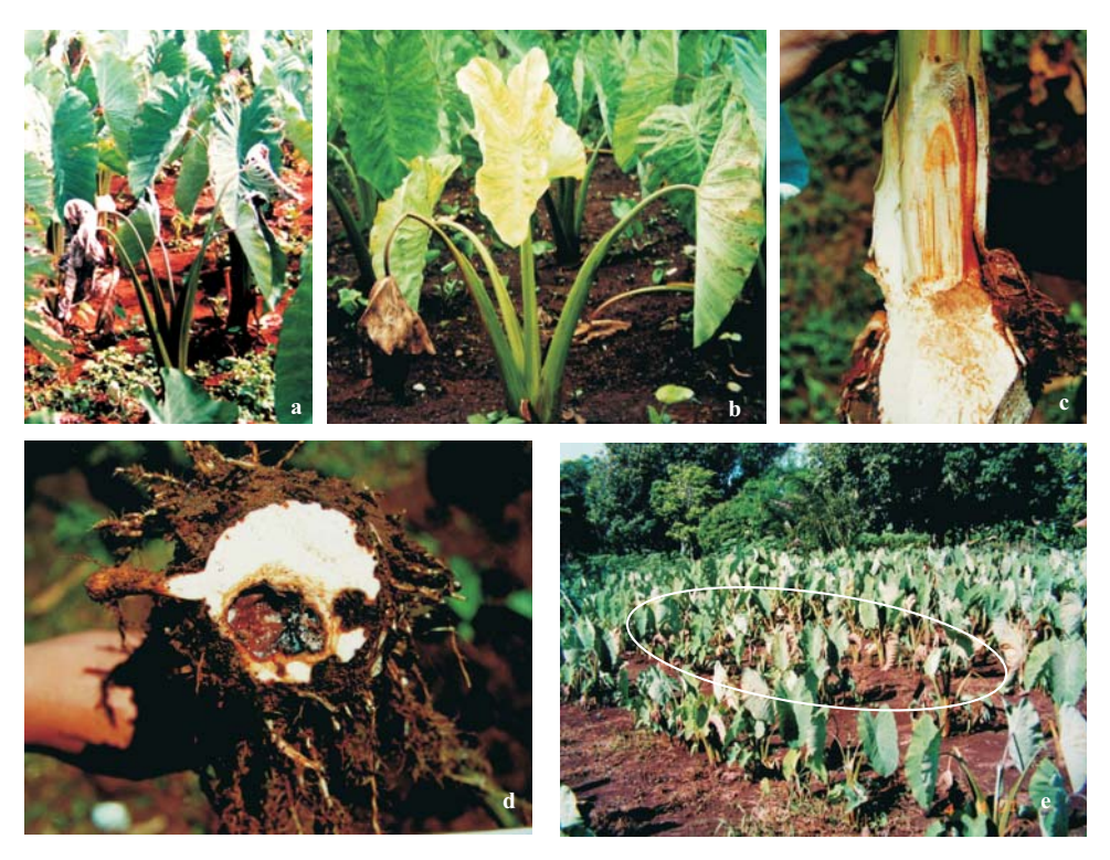
Fig 1 Variation of field symptoms of taro corm rot. a, Wilting and leaf curling symptom; b, leaf chlorosis; c, corm and leaf petiole discoloration; d, corm rotting and hollowing; e, cluster symptom in the field (circled).