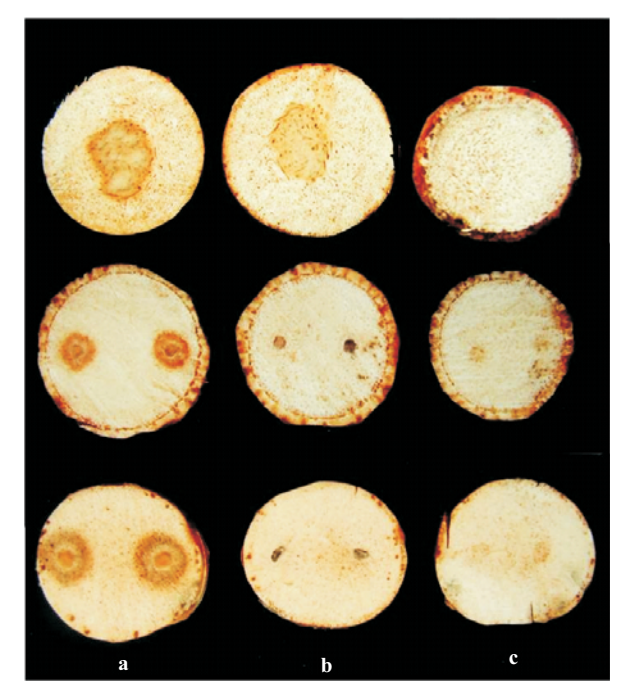
Fig 3 Inoculation test of F solani and F oxysporum on taro (top), giant taro (middle), and blue taro (bottom) using sliced corm. a, Esolani ; b, F . oxysporum; c, non-inoculated

*5 days after inoculation, **not significantly different (P=0.05)