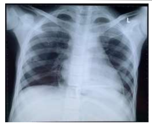
Figure 2. After pericardiocentesis, the size of the heart was reduced, cardio thorax ratio was 54%.