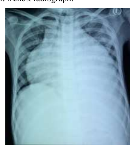
Figure 1. In the first admission, enlarged heart was seen, cardio thorax ratio was 84%.