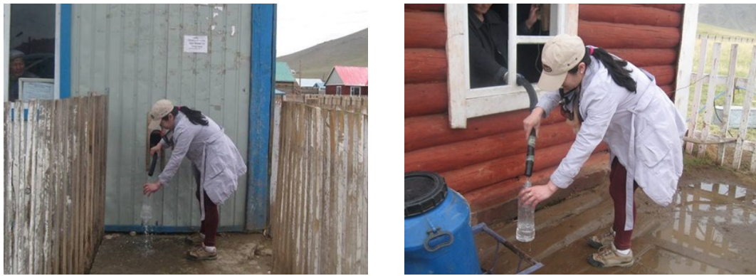
Figure 4. Groundwater sampling in school (right) and center of Jargalant soum (left)

place in valleys of large rivers where they impact on.