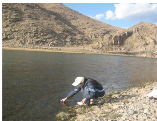
Figure 3. Upstream (right) and downstream (left) of Ider River. 09.20.2013