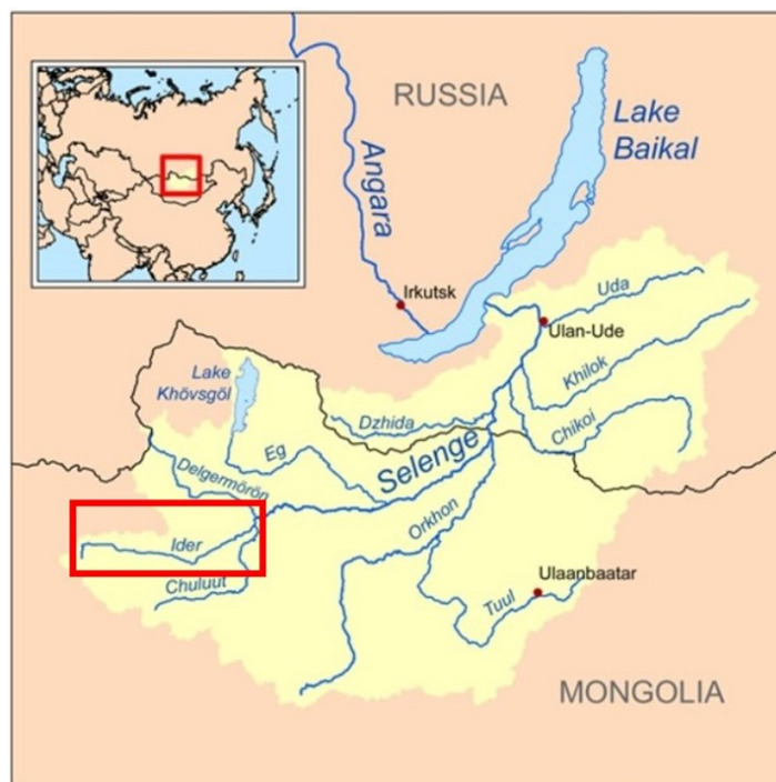
Figure 1. Geographical location of Ider River.

In 1950-1960s, hydrologist Kuznetsov conducted hydrological survey in Mongolia including morphometry and water regime of