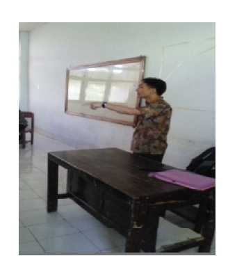
Figure 1: Illustrators Gesture (IG) 1,2,3