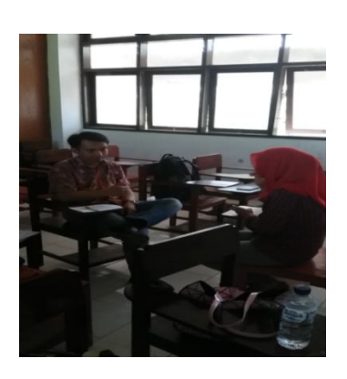
Figure 8: Emblems Gesture (EG)

are quite different in another country. The researcher abbreviated this term with (EG). Furthermore, the researcher has taken an image that can be showed below: (EG 1)