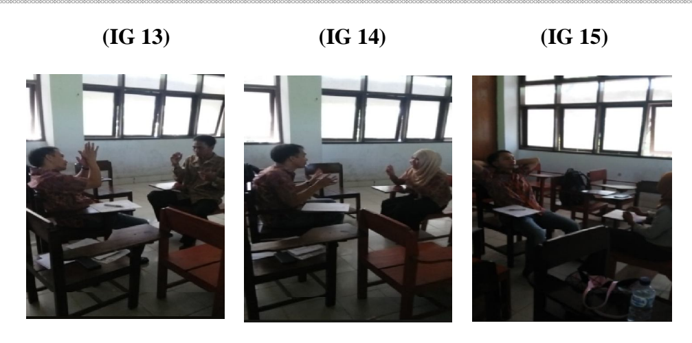
Figure 5: Illustrators Gesture (IG) 13,14,15