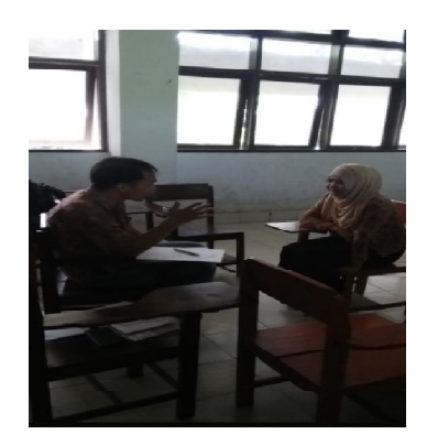
Figure 7: Regulators Gesture (RG)