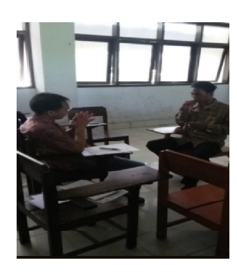
Figure 4: Illustrators Gesture (IG) 10,11,12