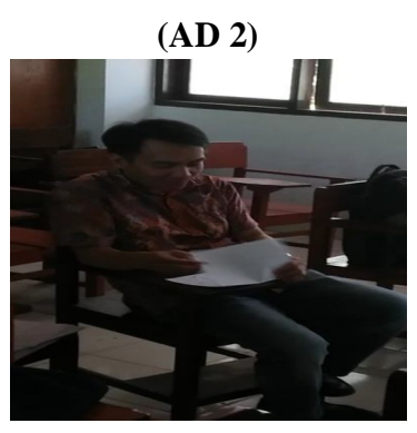
Figure 9: Affects Display (AD) 1,2