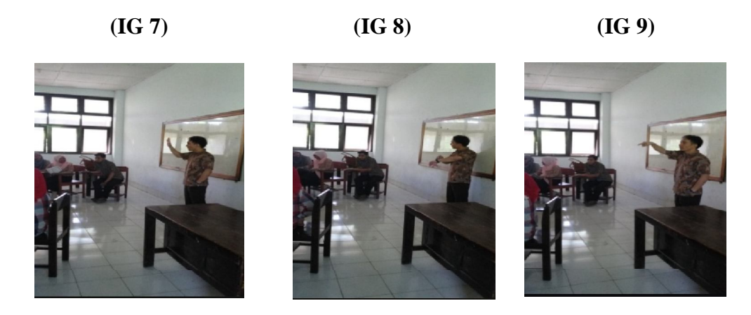
Figure 3: Illustrators Gesture (IG) 7,8,9

The list of images above showed that the teacher used his hand naturally as gesture in teaching English. It can be seen at the first image (IG 4) the teacher holded his head by using his left hand. This gesture was done when the teacher gave a question to the students and said@So, What have you been doing? after asking the question, he directly holded his head with left hand reflexively...The second image (IG 5) also used his hand but using his right hand, he took up his hand to the right side two times because it refers to the using of conjunction (after that) two times also. At the time he said@after that, group eight and after that group nine...okay!. The third image (IG 6) the teacher also used his right hand but this time, he holded his mouth not his head after saying this statement@ because today is bonus you only get five points from me. (The students responded by clapping their hand and said thank you sir!