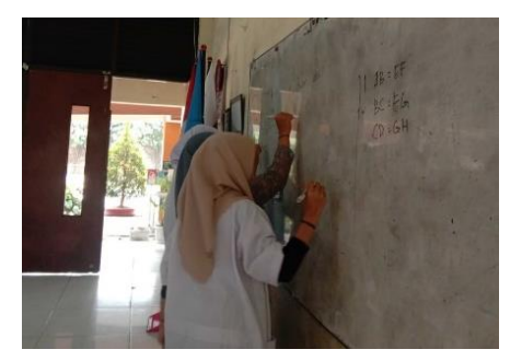
Figure 1. Students work on the blackboard the post-test