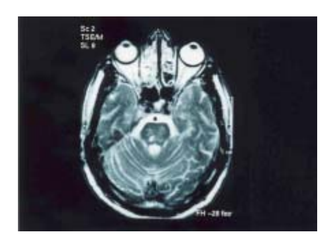
Figure 1. T2 weighted MRI showing infarction in pons

After a careful study of his brain MRI, we considered the patient to be a case of Binswanger disease. This patient received pentoxyphylline