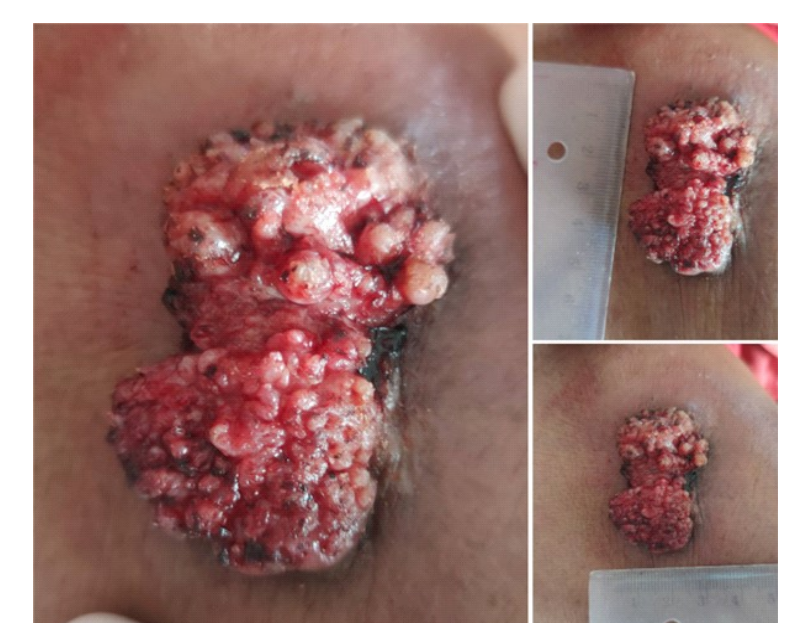
Figure 2. The 5 x 3 x 1 cm fungating mass was seen to be friable, ulcerated, and easily bleeding due to manipulation (scratching, squeezing) by the patient (April 8, 2021)

Excisional biopsy revealed exo-endophytic proliferation of well-differentiated squamous epithelium invading the dermis with marked hyperkeratosis, parakeratosis, acanthosis, papillomatosis, pushing margins, and minimal cellular atypia (Figure 3). Histopathological diagnosis confirmed a verrucous carcinoma with clear resection margins and there was reactive hyperplasia of lymphoid follicles without evidence of nodal metastasis (stage II, T_2N_0M_0 ).