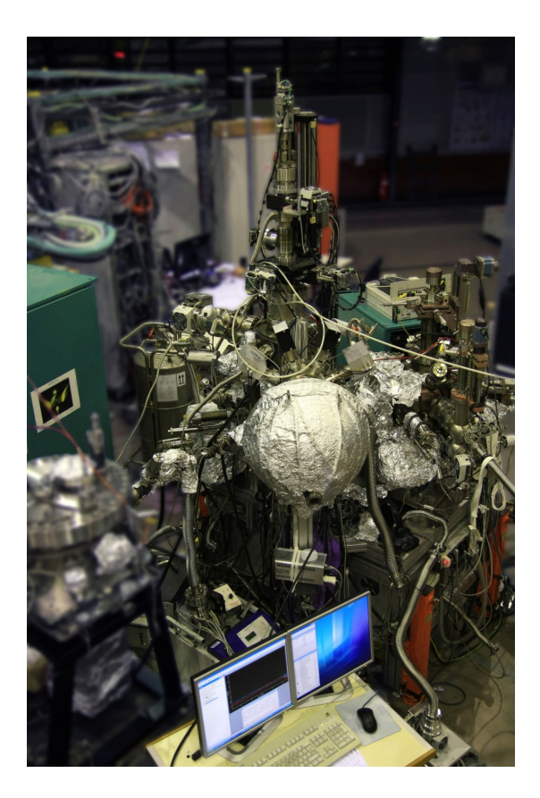
Figure 1: View of the PHOENEXS station.

Currently, the lowest sample temperature on the manipulator is 200 K. Upgrade of the cryostat is planned for 2016, which will improve sample cooling performance.