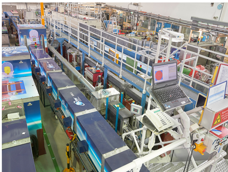
Figure 1: Instrument KWS-3.

The instrument covers the Q range of small angle light scattering instruments. Especially when samples are turbid due to multiple light scattering, V-SANS gives access to the structural investigation. Thus, the samples do not need to be diluted. The contrast variation method allows for highlighting of particular components.