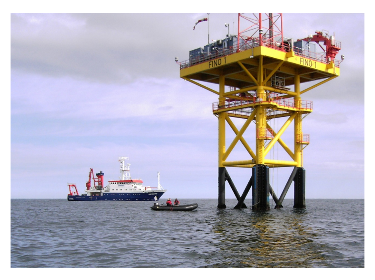
Figure 2: Heincke operating at the research platform FINO1, German Bight, North Sea