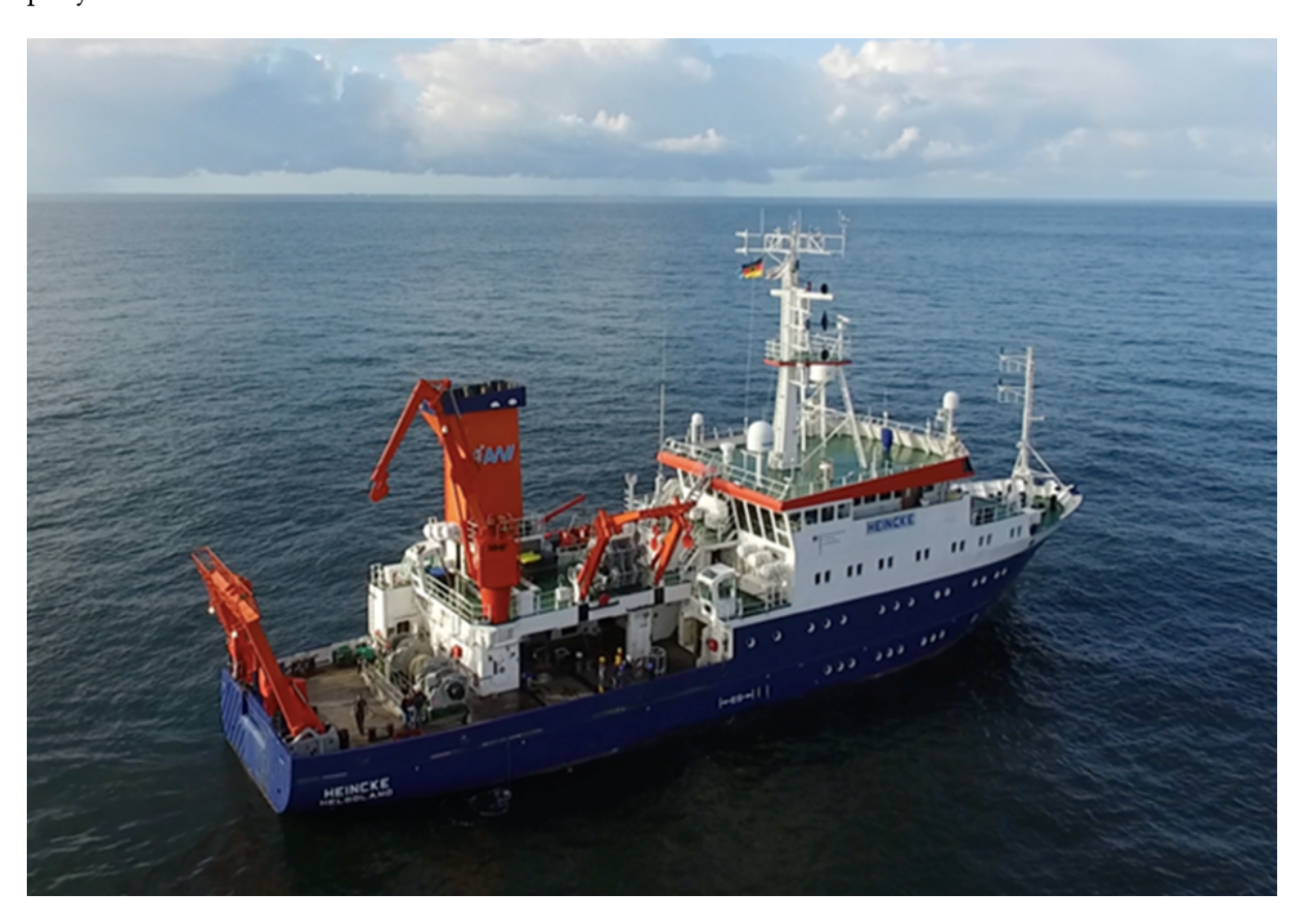
Figure 1: Heincke working at sea.

RV Heincke is a research vessel, commissioned in 1990. It is owned by the Federal Ministry of Education and Research and it is operated by the Alfred-Wegener-Institut and managed by the private shipping company BRIESE in Leer. The homeport is Bremerhaven. The ship is designed for operation in the North Atlantic and its shelf seas like the North and Baltic Sea. RV Heincke is equipped for multidisciplinary use and meets the demands of research in biology, geology, geophysics, chemistry and oceanography. It has four laboratories, including a temperature-controlled laboratory for working under constant temperature conditions. Additional laboratory and other special containers can be stowed on deck and in a special container room. A cold store room and tank capacities to transport sea water are available. The fully automatic weather station is maintained by the German weather service (DWD) in the port in Bremerhaven. Extensive hoisting equipment, such as cranes and winches, is available for the deployment of sampling devices and measuring instruments. RV Heincke is equipped with hydroacoustic echo sounders. The winch capacities and the hydroacoustic systems are designed for a maximum working depth of approximately 2000m water depth. RV Heincke is in average 290 days per year at sea.