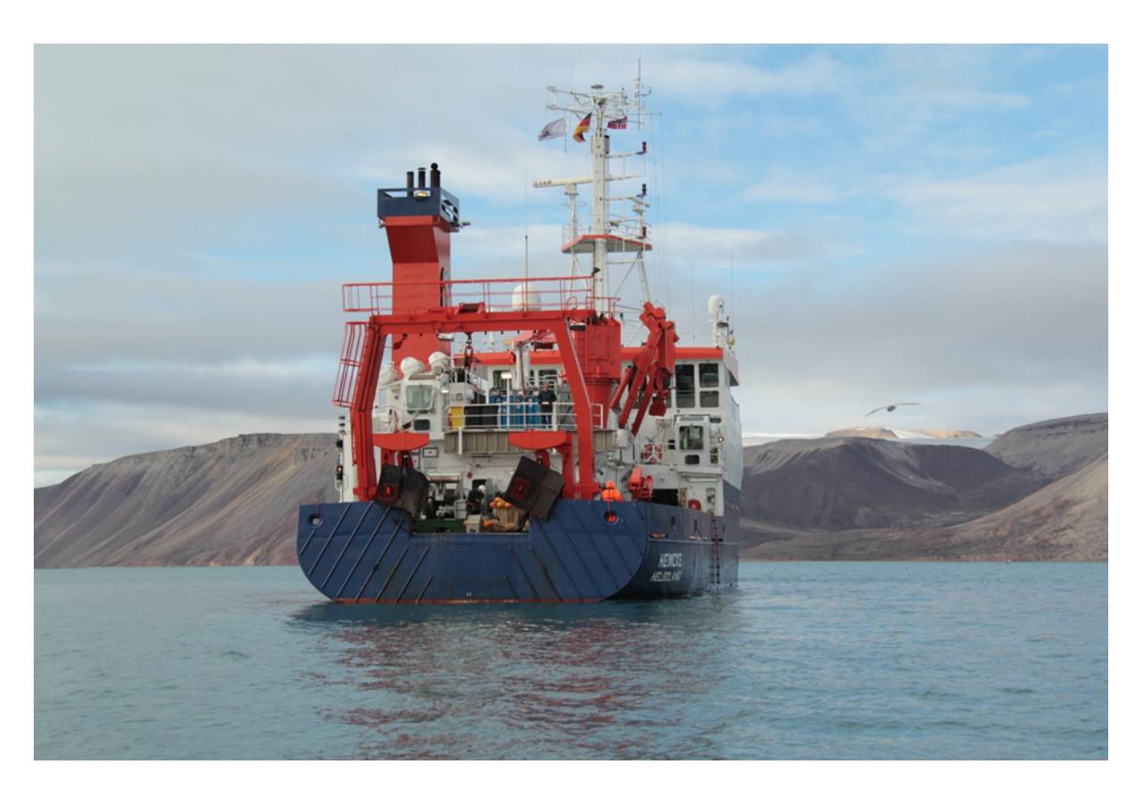
Figure 3: Heincke in coastal waters of Svalbard (Arctic).