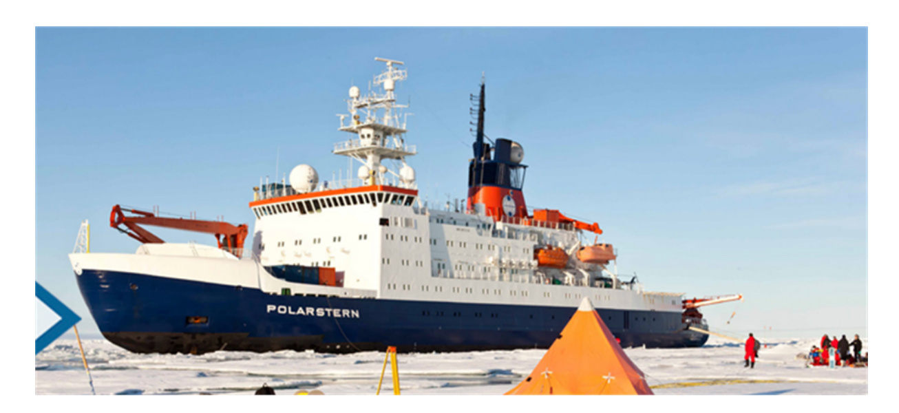
Figure 1: Polarstern working in polar regions.

port is Bremerhaven. The ship is designed for operation in polar waters even during wintertime, and is currently one of the top polar research vessels worldwide, combining good icebreaking properties with a wide range of research capacities. RV Polarstern is equipped for multidisciplinary use and meets the demands of research in biology, geology, geophysics, glaciology, chemistry, oceanography, and meteorology. It has nine scientific laboratories. Additional laboratory containers can be stowed both on and below deck. Cold storage rooms and aquarium containers make it possible to conduct experiments on board as well as transport of samples and living marine organisms. Extensive hoisting equipment, such as cranes and winches, is available for the deployment of sampling devices. RV Polarstern is equipped with hydroacoustic echo sounders that can be used to conduct measurements at water depths of up to 10,000 meters and up to 150 meters into the seafloor. It is at sea for an average of 310 days per year. In addition to scientific expeditions, RV Polarstern is part of an international programme to supply the research stations in the Antarctic, making it the most important tool for the supply of the German Neumayer Station III and field research activities. Supply trips are always combined with scientific programmes.