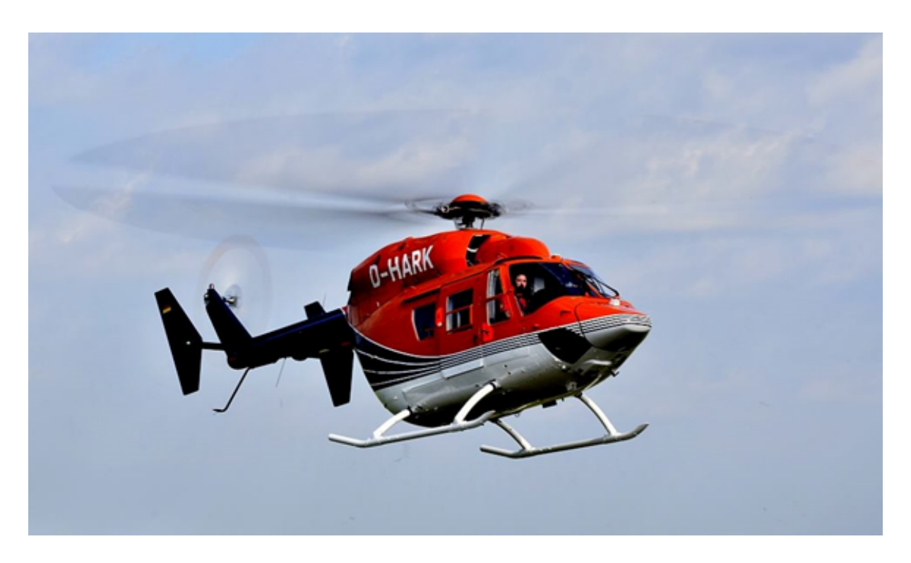
Figure 2: Polarstern Helicopter BK 117 - C1.