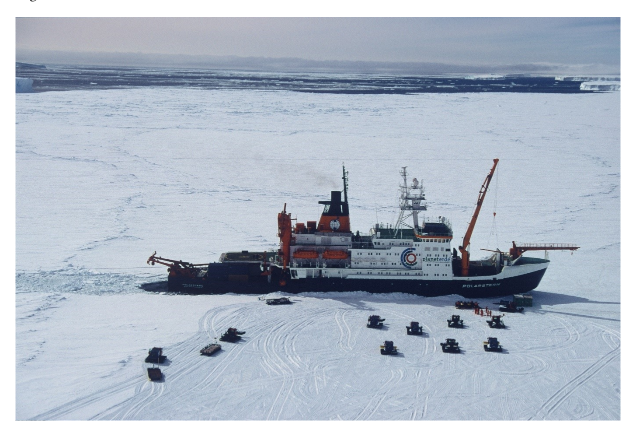
Figure 5: Polarstern in the Atka Bay, Weddell Sea, Antarctica suppling Neumayer Station III.

Supply and waste disposal for Neumayer Station III takes place at the Atka Iceport, directly on the edge of the ice shelf (Figure 5) in Atka Bay. Both cranes (on the fore and aft parts of the deck, respectively) are used for loading and unloading. Bunker is handed over from the ship to tank containers on the ice edge.