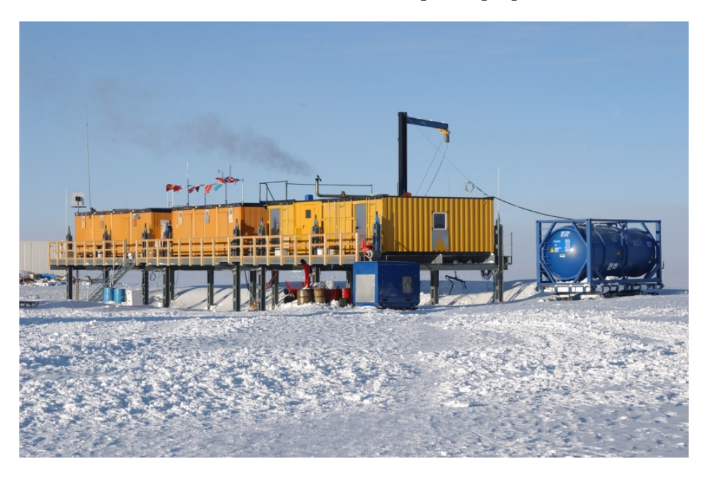
Figure 2: Kohnen Station.

The Kohnen Station (75°S and 00°04'E) was inaugurated in 2001 as a logistics base during Antarctic summers. It is named after Heinz Kohnen (1938-1997), who was the head of the AWI logistics department. The station consists of eleven standard 20-feet containers sitting on a 32 m long and 8 m wide platform. The platform rests on steel pillars and can be jacked up (Figure 2) in order to compensate for snow accumulation. A 100 kW generator provides all power needs for the base and the deep drilling operations. The logistics for Kohnen Station is based mainly on land-transport facilities. Once during a field season, a sledge traverse from Neumayer III Station supplies Kohnen Station with fuel, food and scientific equipment. Smaller amounts of cargo and the majority of the personnel are transferred via aircraft to Kohnen Station. The station can accommodate up to 20 people.