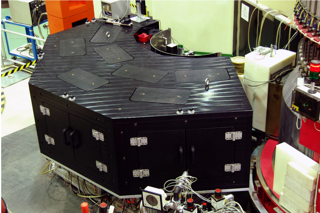
Figure 1: View of E9.

Depending on sample scattering power and volume and the resolution settings of the instrument, full powder diffraction patterns of a quality suitable for Rietveld refinement can be collected as fast as 30 minutes. With small 1 cm 3 samples and high resolution, between 1 and 6 hours should be estimated, depending on the scattering power of the sample. Scans measuring only a selected angular with fixed detector position can be as fast as 10 minutes per step for good scatterers.