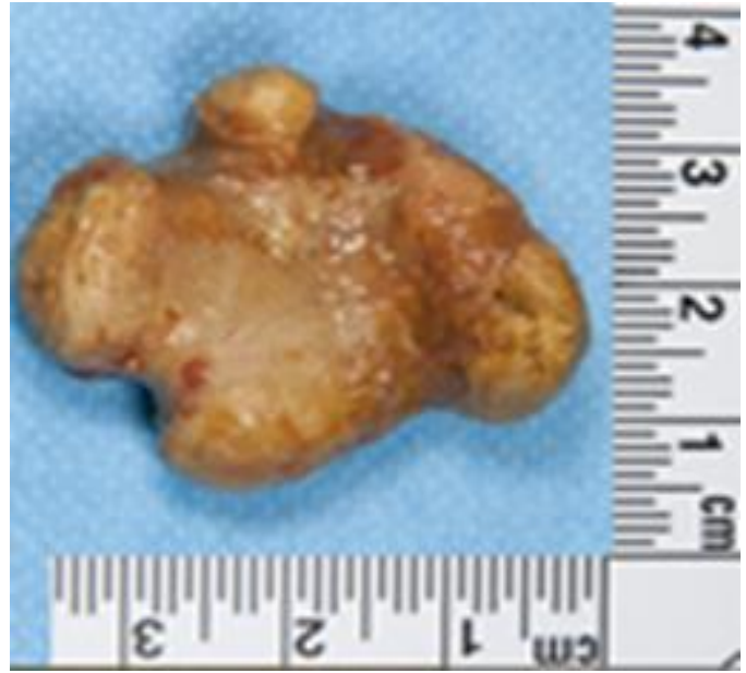
Figure 2c. Dimensions of delivered enterolith