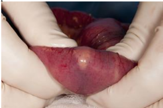
Figure 2a. Intraoperative handling of entero- Figure 2b. Enterotomy for enterolith delivery lith

The patient was managed in the surgical high dependency unit post-operatively for a day, then stepped down to the ward. The patient made an uneventful recovery apart from the ileus for short period of time.