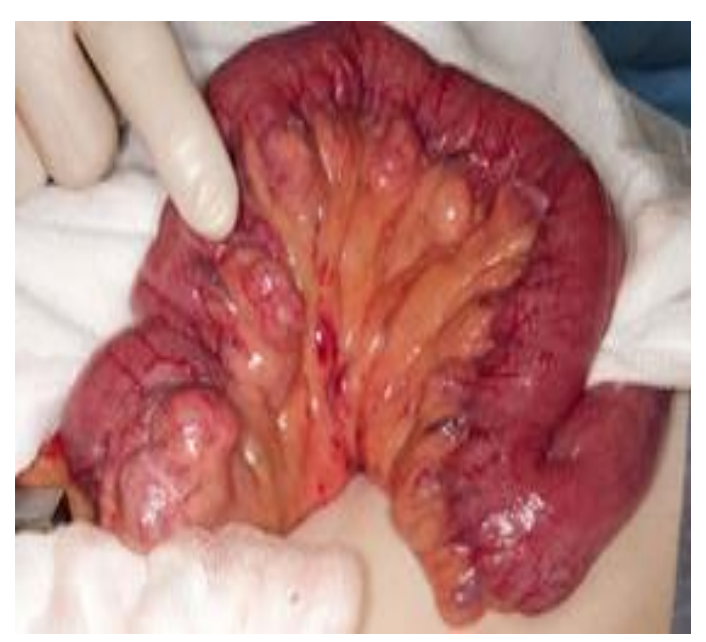
Figure 2d. Jejunal diverticula found preoperatively