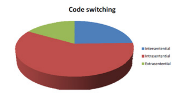
Figure 3 Code-Switching