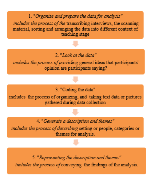
Figure 1 Steps in Data Analyzing

Furthermore, the research data analysis uses the grounded theory method that the research departs from the debates from experts regarding the use of the first language in foreign language classes. There are five steps in analyzing the data found that are adopted from Creswell and Creswell (2018), as shown in Figure 1. The steps are organizing and preparing the data, looking at the data, coding, generating a description and themes, and representing the description and themes.