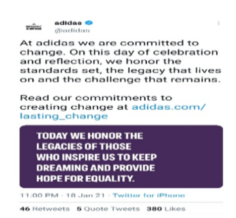
Figure 2 Adidas's Tweets in Image Form

Eighth is the tweet on January 18, 2021; "Adidas is committed to celebrating and honoring Black excellence all year round." The themes of the tweet are the declarative statement, expressing excitement, humanitarian, and photoshare. Adidas states their commitment to glorify and honor black excellence throughout the year as their support for black people. This tweet is in a media or image form and represents solidarity (Figure 2).