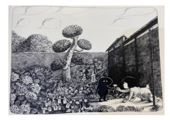
Figure 3 Conceptual Symbolic Image

Figure 3 shows Kuroino giving the flower to Watashi in a park where they do their exciting adventure. Although its color is monochrome (black and white), it clearly shows plants and flowers in the park, representing a beautiful place. Conceptual process is also shown in images 13, 16, 17, 18, 19, 20, 21, 22, 23, 24, 25, 27, 28, 30, and 32. Visual data in the narrative process shows an amount that is almost the same as the conceptual process. It shows that the writer and illustrator in Kuroino invite the reader to enjoy Kuroino and Watashi's adventure by enjoying the environment where the experience takes place.