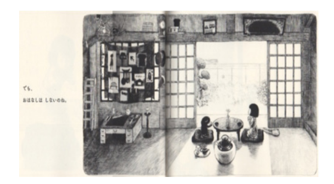
Figure 4 Compositional Meaning (Given/New Information)

Compositional meaning is achieved by the layout of the image, which consists of information value, salience, and framing (Kress & van Leeuwen, 2020). The first principle is information value. It is the placement of several elements that give specific value, specific as in 'center/margin' and 'given/new'. In Kuroino , Watashi and Kuroino's participants are usually in the center of the image, as if they provide essential information from the whole picture. Thus, it can be said that these two participants are dominant in some pictures. Information structure given in the double-page book, Kuroino , shows the domination of verbal text on the left (given) and visual text on the right (new), as shown in Figure 4.