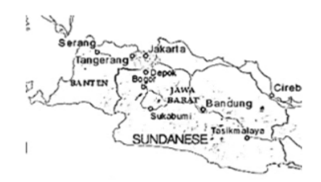
Figure 1 Map of Dialects of Sundanese Language in West Java (Muslim et al., 2010)

Perwitasari (2018) has noted that Sundanese is used daily by about 34 million individuals in Indonesia, the second most commonly spoken language in Indonesia after Javanese. Sundanese is spoken in the western part of the island of Java (Figure 1). In Sundanese, it can be found at least four main dialects: Banten, Bogor/Karawang, Priangan, and Cirebon (Muslim et al., 2010). The Banten dialect is spoken in several cities around Banten; the Bogor/ Karawang dialect is uttered in several big cities such as Tangerang, Bogor, Purwakarta, Krawang, and Subang; the Priangan dialect is spoken in Priangan; and the Cirebon dialect is spoken in Cirebon, Brebes, and Cilacap. Sundanese is distinguished into four speech levels: high basa lemes , neutral basa sedeng , everyday basa kasar, and low basa tjohag (Perwitasari, Klamer, & Schiller, 2016). The students who participate in the current research speak the Bogor/Karawang dialect of Sundanese.